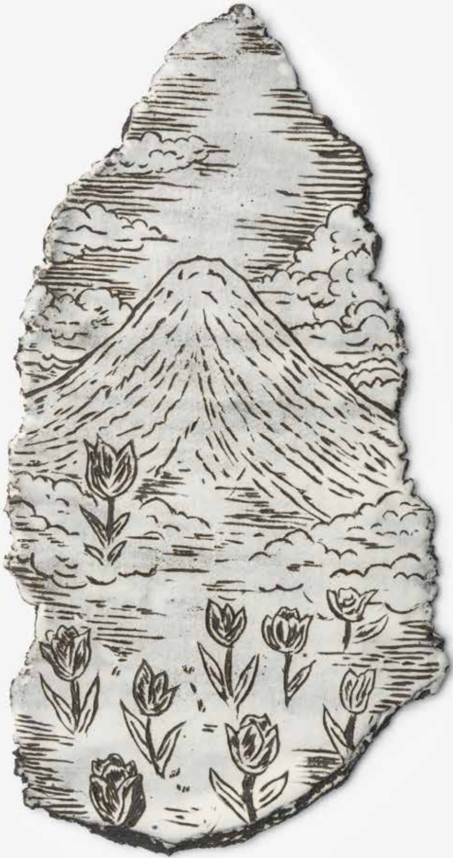
Artist: Marjan Baniyadi Title: Damavand II B Year: 2026 Medium: Ceramic Size: 9 x 5 inches