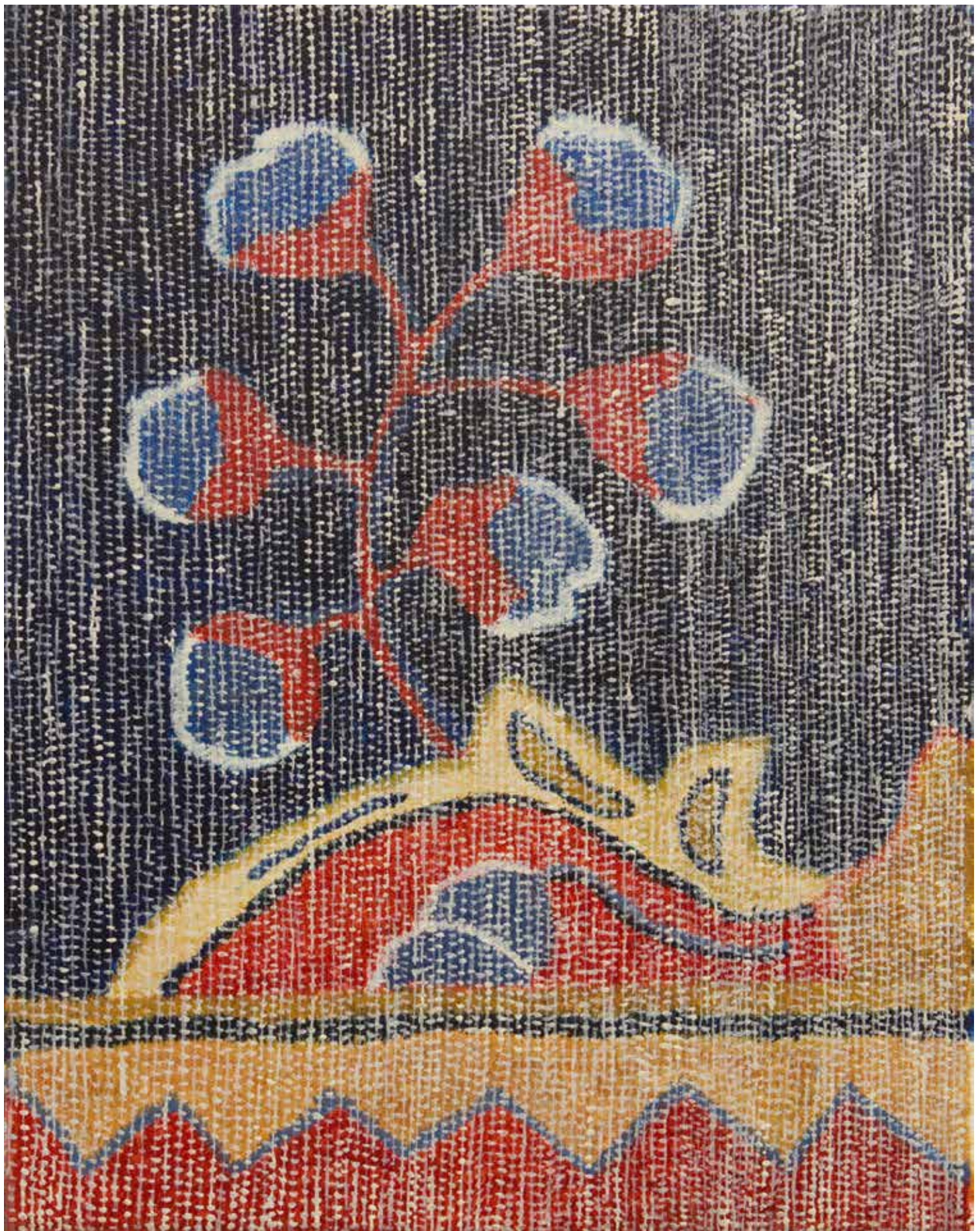
Artist: Marjan Baniyadi Title: Winter Night II Year: 2025 Medium: Oil on canvas Size: 14 x 11 inches