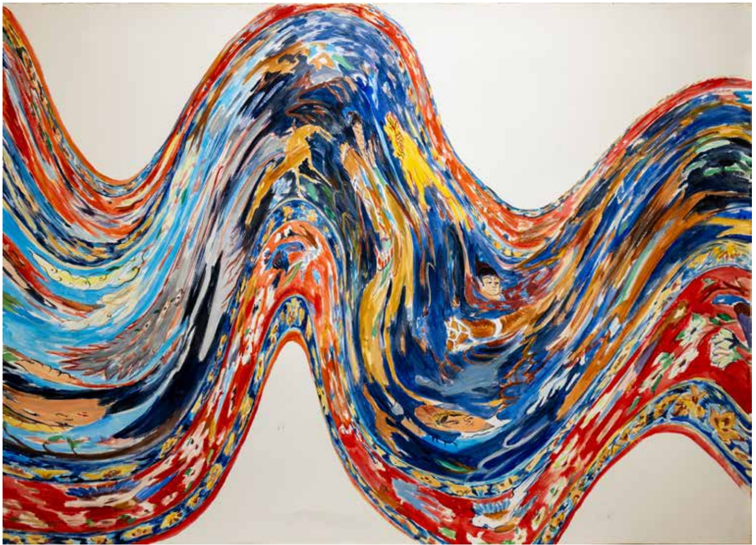
Artist: Sanié Bokhari Title: Frequency of Leaving Year: 2026 Medium: Acrylics and graphite on paper Size: 36 x 48 inches