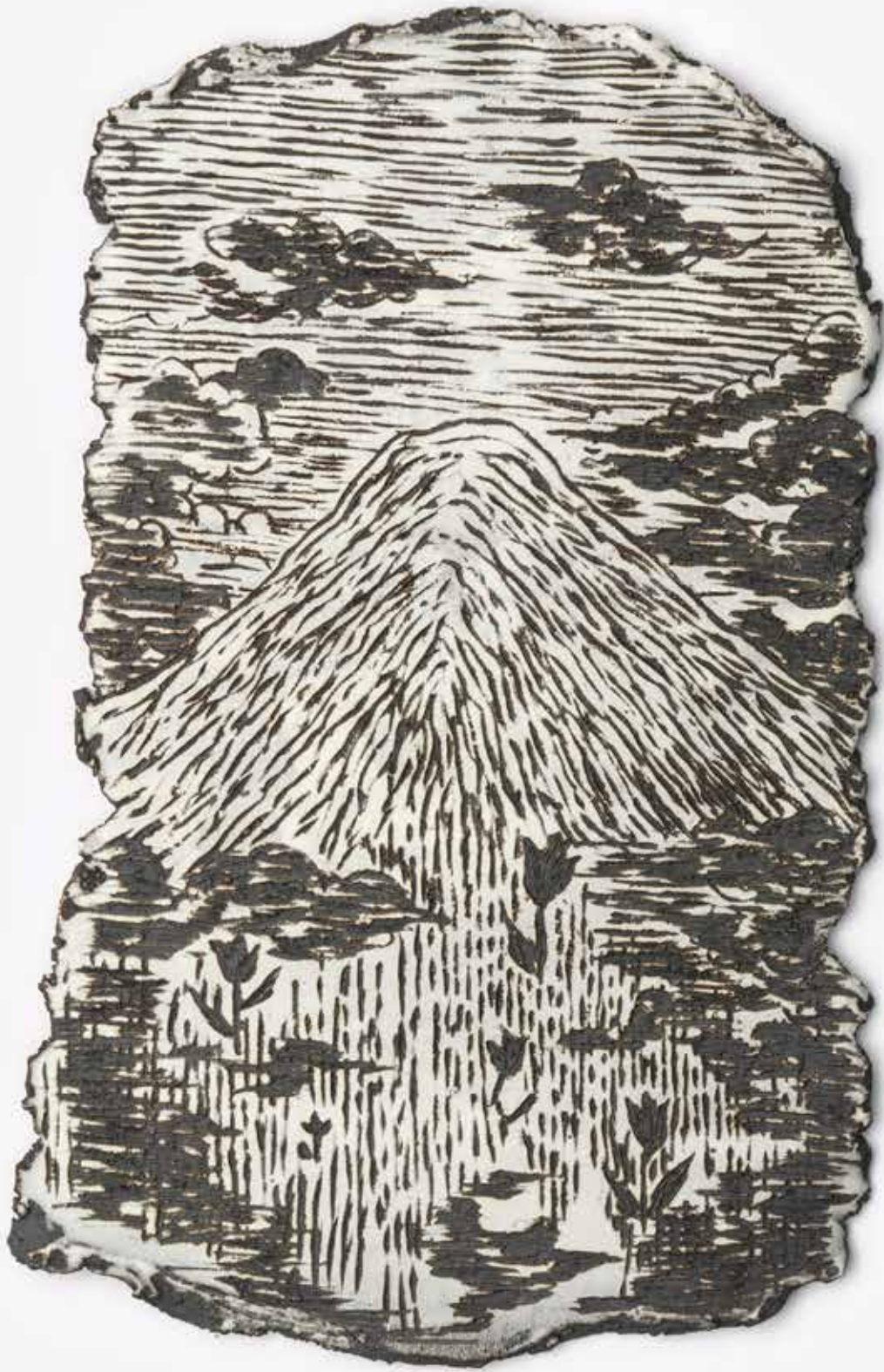
Artist: Marjan Baniasadi Title: Damavand II C Year: 2026 Medium: Ceramic Size: 9 x 5 inches