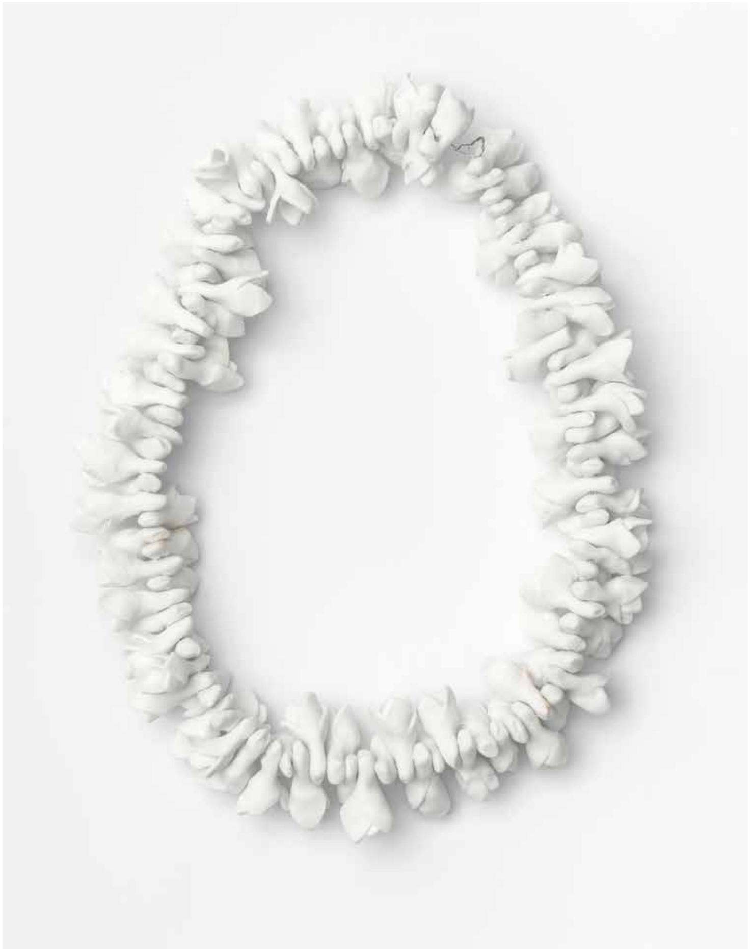
Artist: Marjan Baniyadi Title: Jasmine Year: 2026 Medium: Chinese porcelain Edition: 1/5 Size: 12 x 2 x 2 inches