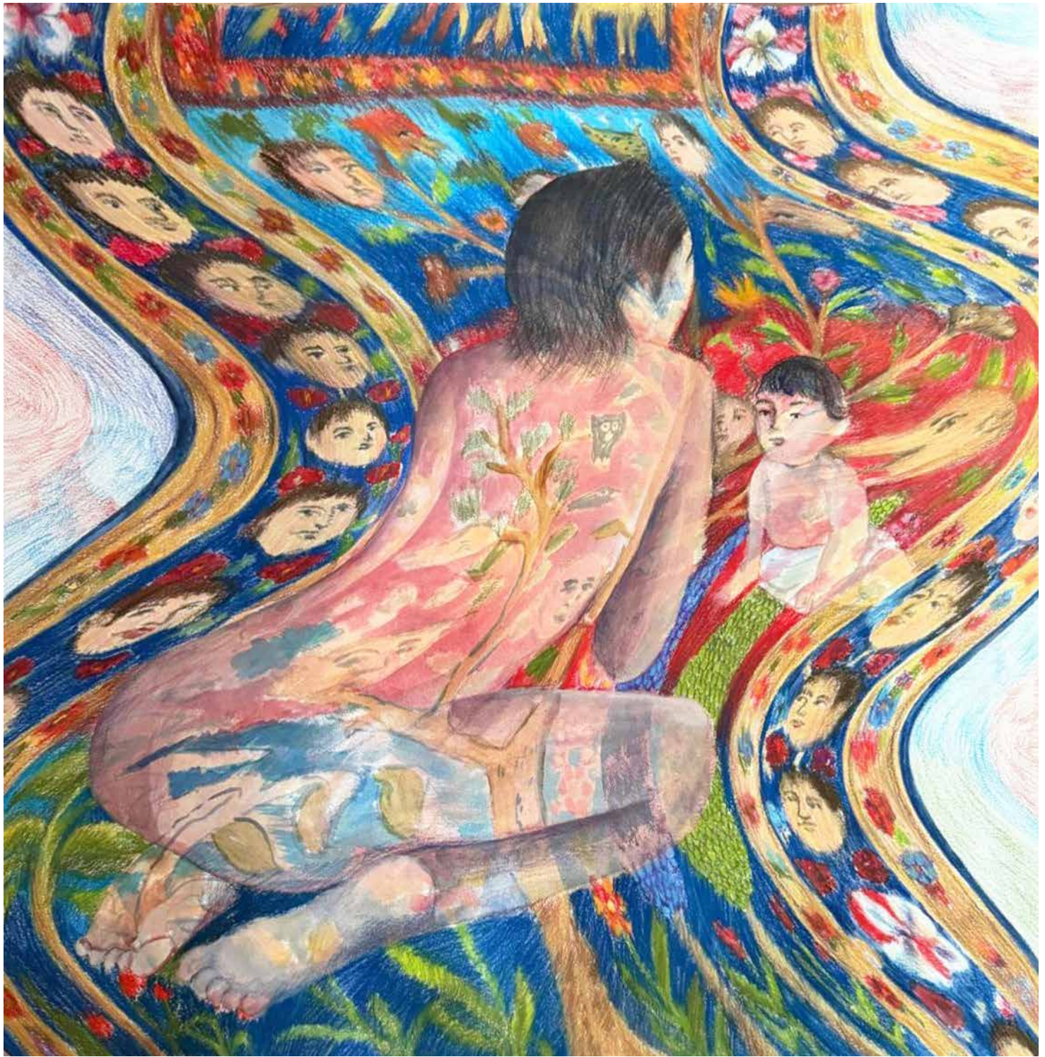
Artist: Sanié Bokhari Title: Kneeling Beside You Year: 2026 Medium: Acrylics and pastel on paper Size: 25 x 24 inches