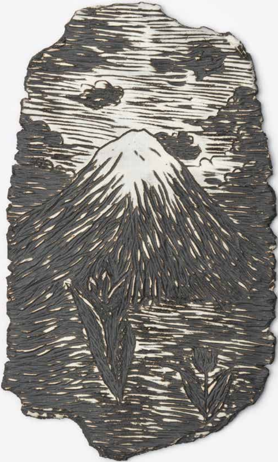
Artist: Marjan Baniyadi Title: Damavand II A Year: 2026 Medium: Ceramic Size: 9 x 5 inches