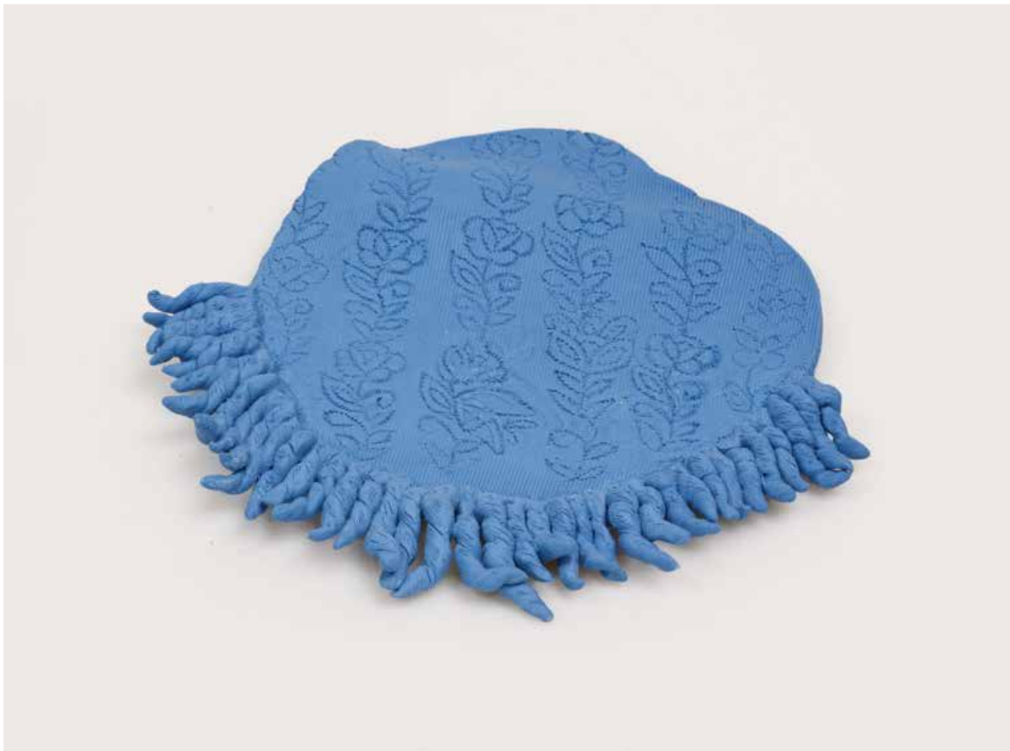
Artist: Marjan Baniyadi Title: Flowers of the Blue Year: 2025 Medium: Porcelain Size: 7 x 7 x 2 inches