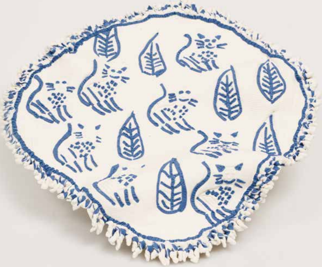
Artist: Marjan Baniasadi Title: The Gardener Year: 2025 Medium: Porcelain Size: 10 x 10 x 2 inches