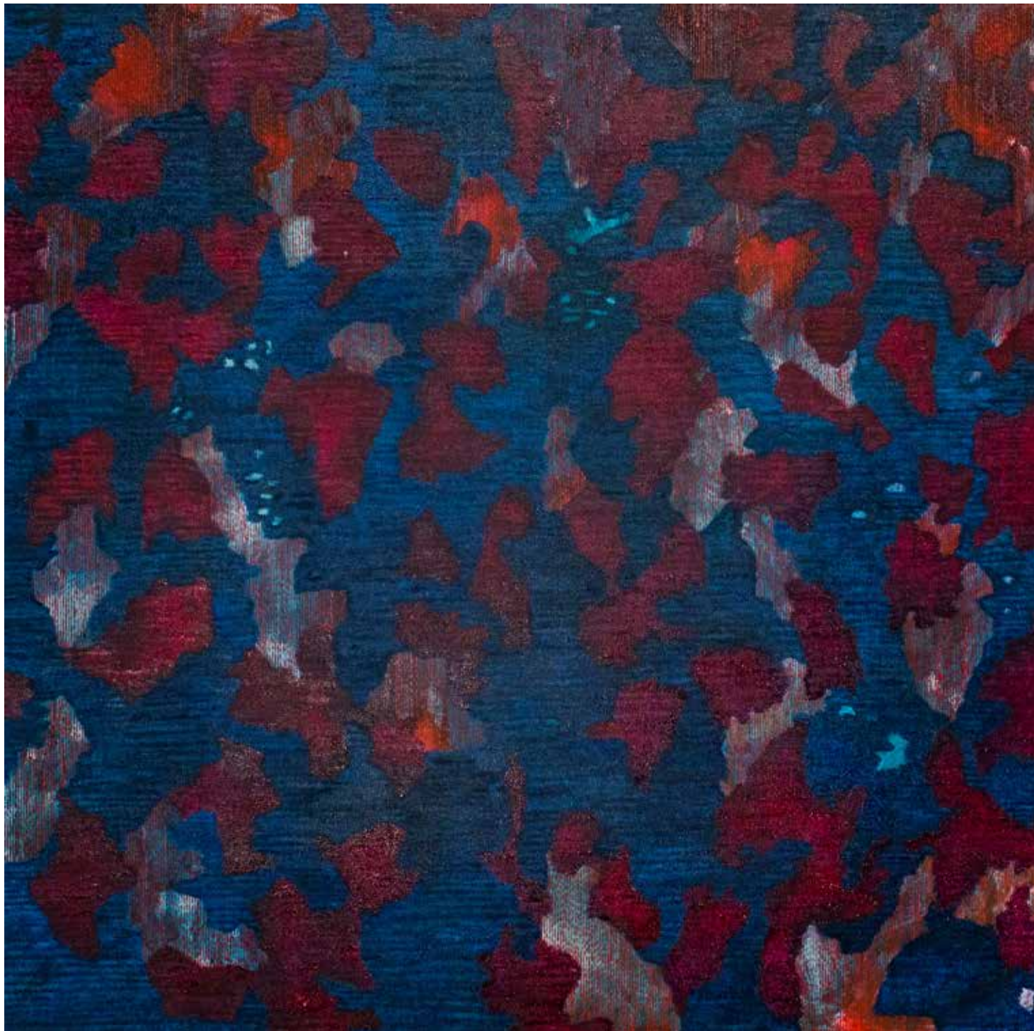
Artist: Marjan Baniyadi Title: Whispers of the Night Year: 2023 Medium: Oil on canvas Size: 45 x 45 inches