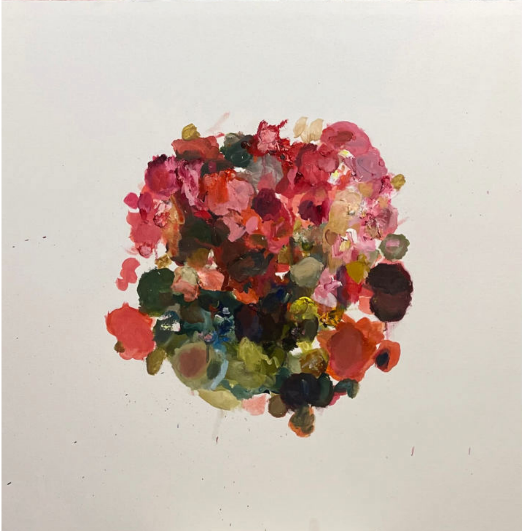
Title: Rose Year: 2024 Medium: Oil on canvas Size: 48 x 24 inches Price: PKR 800,000/-