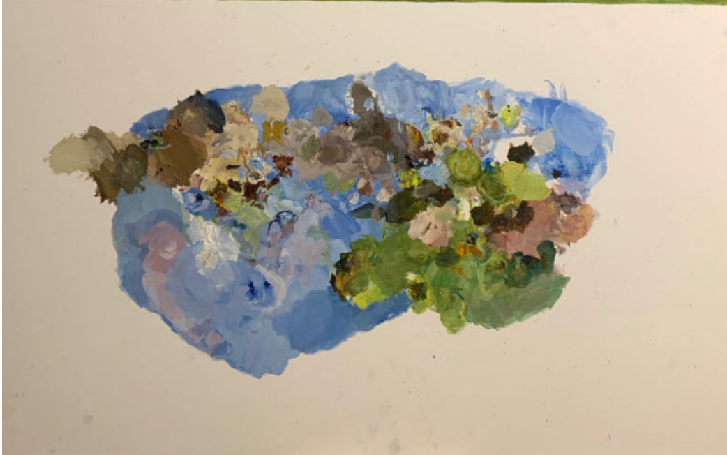
Title: Moen Jo Daro Year: 2024 Medium: Oil on canvas Size: 60 x 48 inches Price: PKR 1,000,000/-