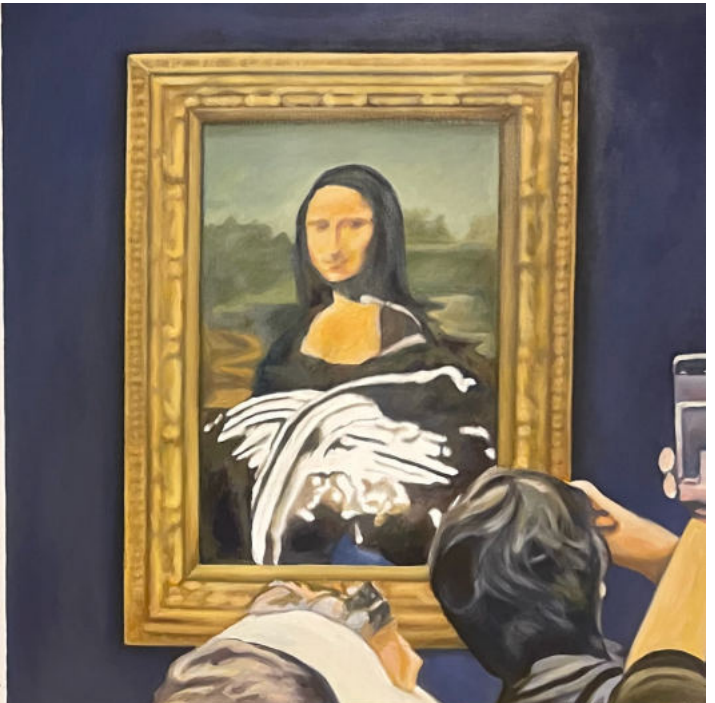
Title: Still life (Mona Lisa) Year: 2024 Medium: Oil on canvas Size: 36 x 60 inches Price: PKR 1,000,000/-