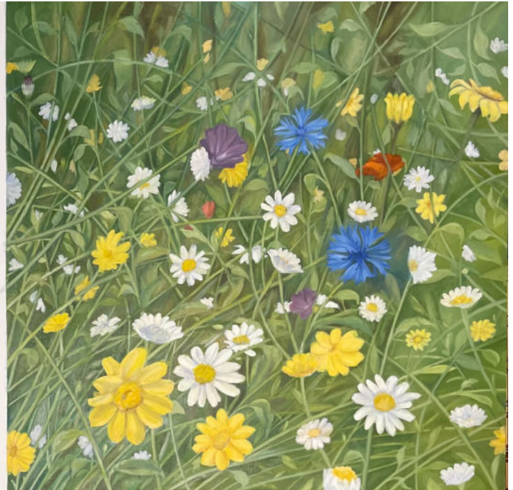
Title: Flowers Year: 2024 Medium: Oil on canvas Size: 24 x 48 inches Price: PKR 800,000/-