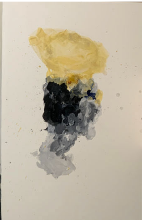
Title: Sadeqain Year: 2024 Medium: Oil on canvas Size: 36 x 60 inches Price: PKR 1,000,000/-