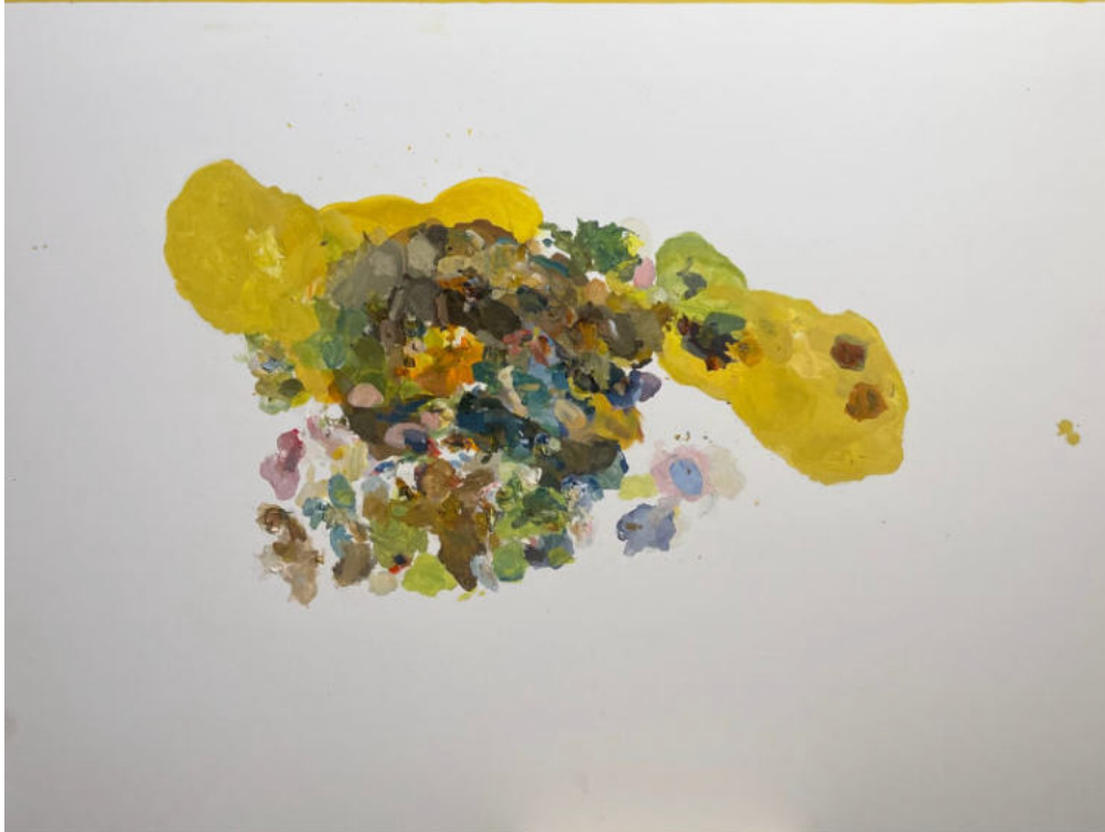
Title: Still life (Van Gogh) Year: 2024 Medium: Oil on canvas Size: 48 x 72 inches Price: PKR 1,000,000/-