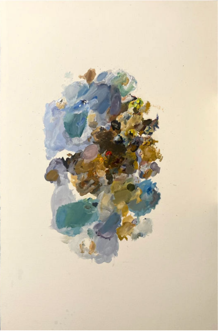
Title: Wall Painter Year: 2024 Medium: Oil on canvas Size: 36 x 48 inches Price: PKR 800,000/-