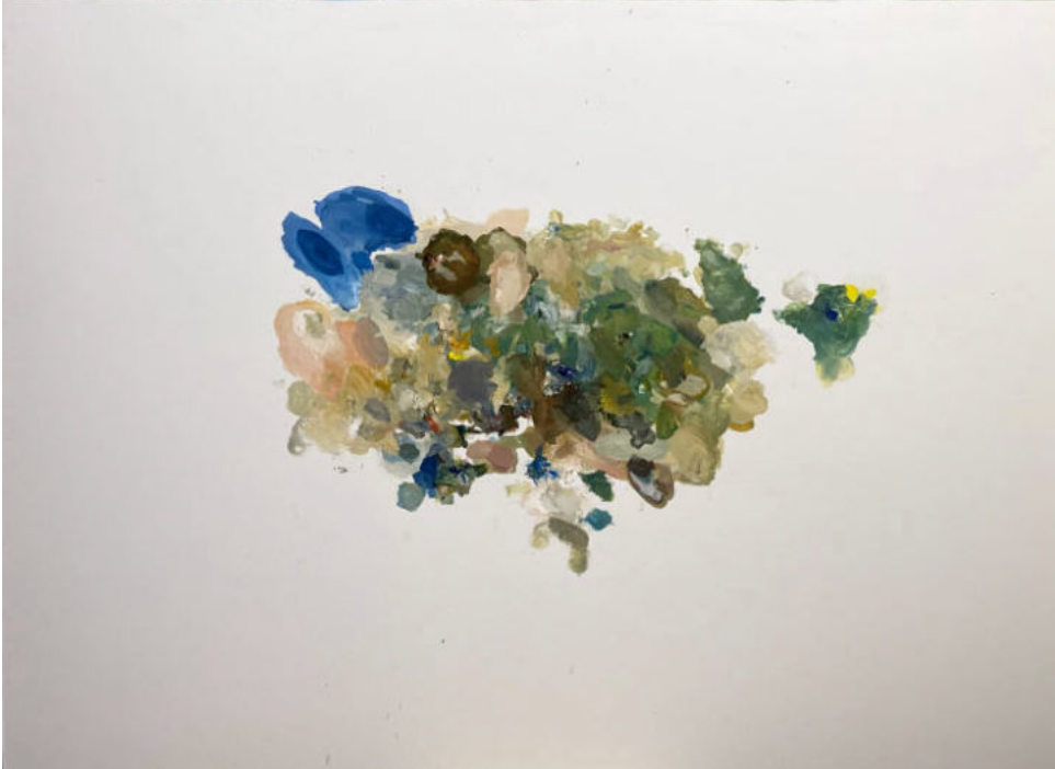
Title: Landscape of Pakistan Year: 2024 Medium: Oil on canvas Size: 72 x 48 inches Price: PKR 1,000,000/-