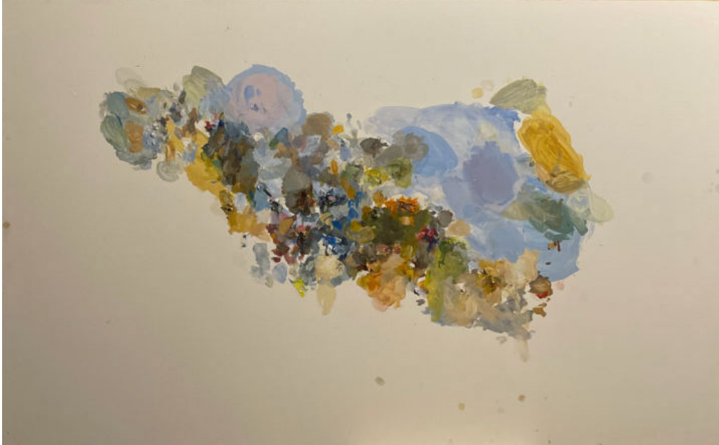
Title: Sachal Jo Rozo Year: 2024 Medium: Oil on canvas Size: 60 x 48 inches Price: PKR 1,000,000/-