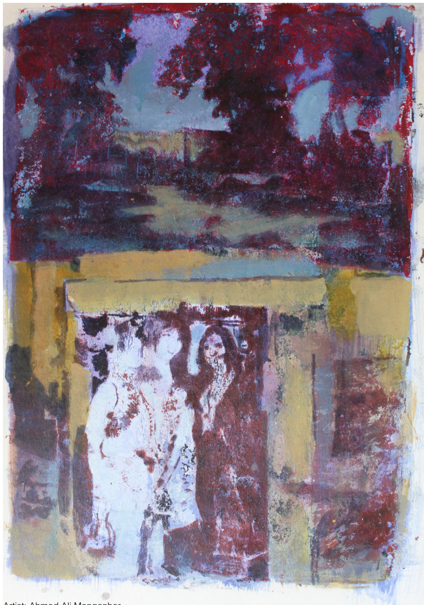
Artist: Ahmed Ali Manganhar Title: Facade Year: 2023 Medium: Acrylics on paper Size: 11 x 8 inches