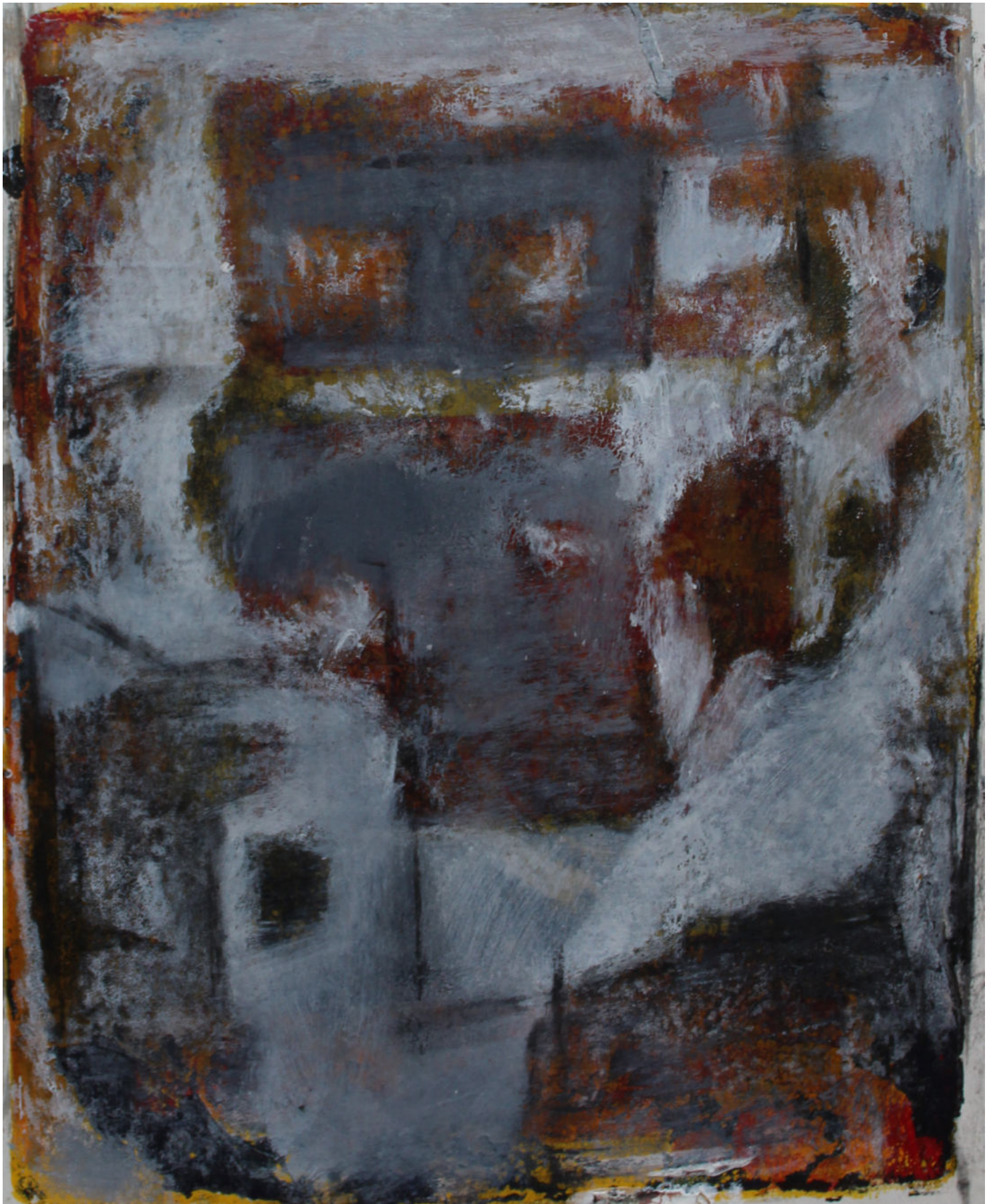
Artist: Ahmed Ali Manganhar Title: Chamabar Road Year: 2023 Medium: Acrylics on paper Size: 10 x 8 inches