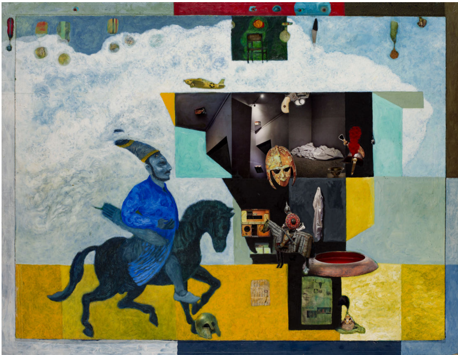
Artist: Afshar Malik Title: Art of the WAR of the Art Year: 2019 Medium: Oil paint and collage on board Size: 33 x 43 inches