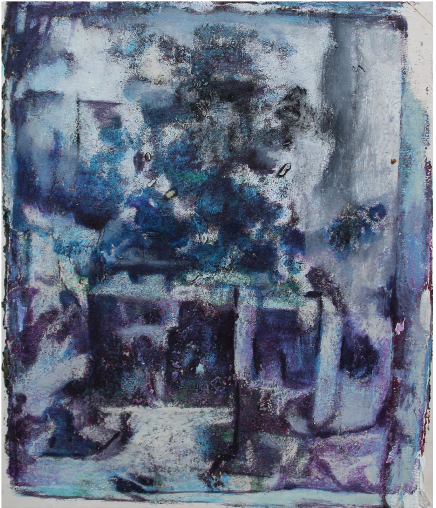
Artist: Ahmed Ali Manganhar Title: Faded Memory Year: 2023 Medium: Acrylics on paper Size: 10 x 8 inches