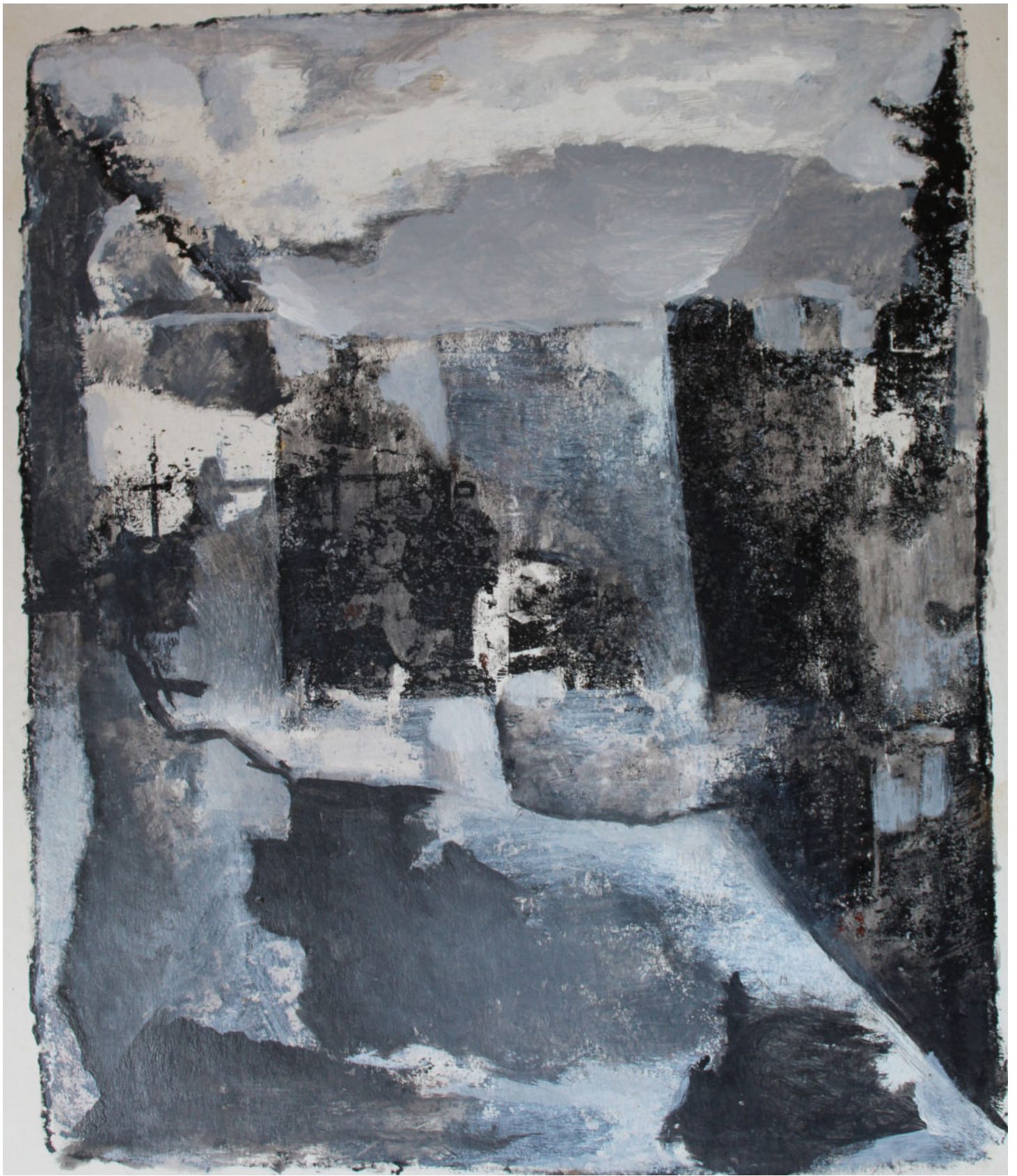
Artist: Ahmed Ali Manganhar Title: Home Alley Year: 2023 Medium: Acrylics on paper Size: 10 x 8 inches