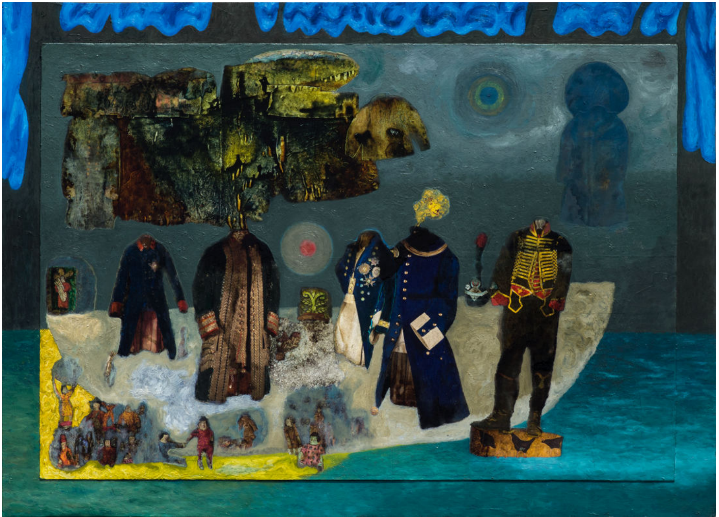
Artist: Afshar Malik Title: Behind Every Successful Hunting Year: 2019 Medium: Oil paint and collage on board Size: 26 x 36 inches