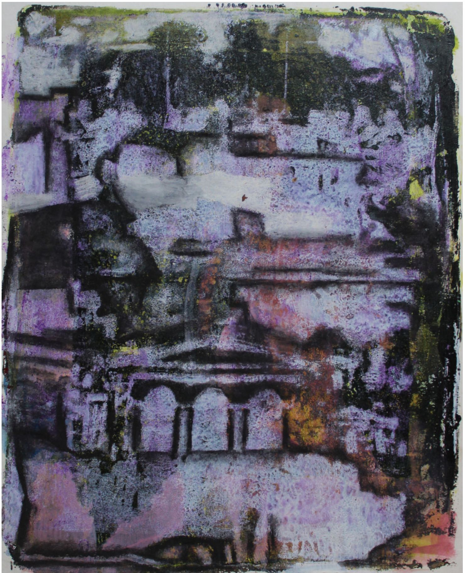
Artist: Ahmed Ali Manganhar Title: Mohallah Year: 2023 Medium: Acrylics on paper Size: 10 x 8 inches