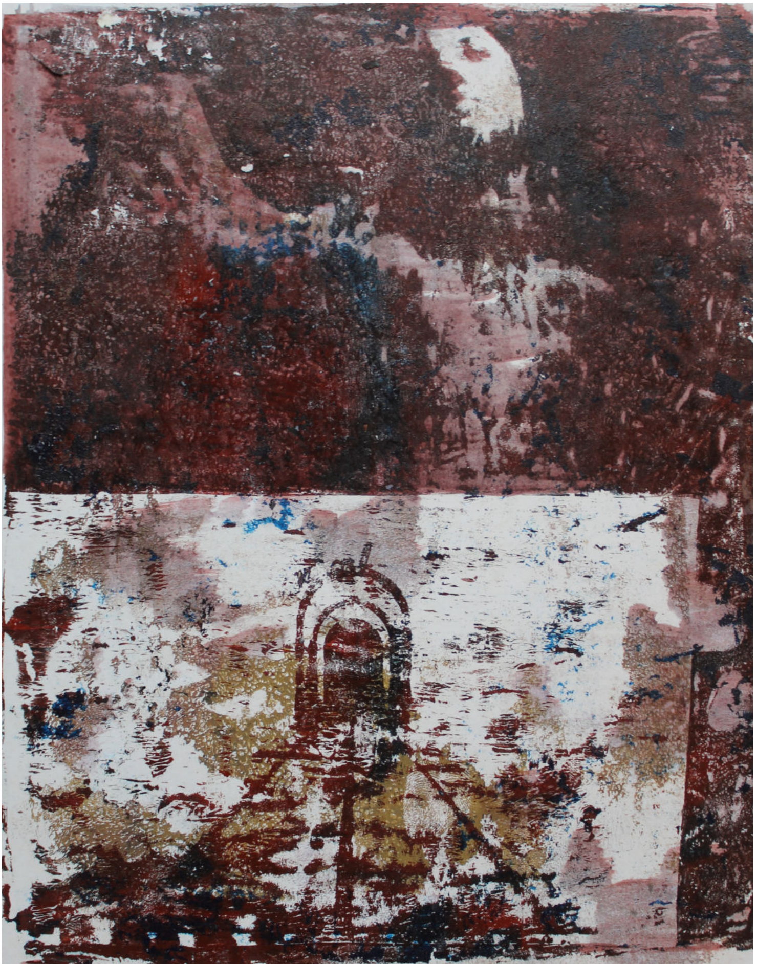
Artist: Ahmed Ali Manganhar Title: Going Home Year: 2023 Medium: Acrylics on paper Size: 10 x 8 inches