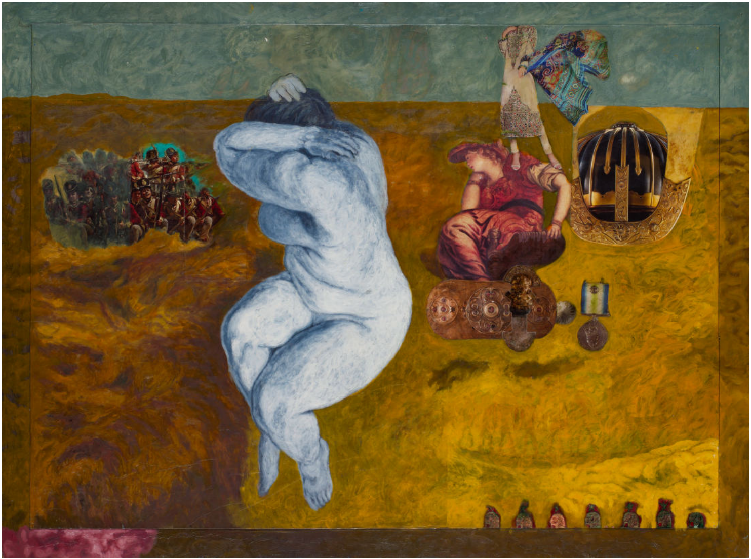
Artist: Afshar Malik Title: A Tale With No End Year: 2019 Medium: Oil paint and collage on board Size: 36 x 48 inches