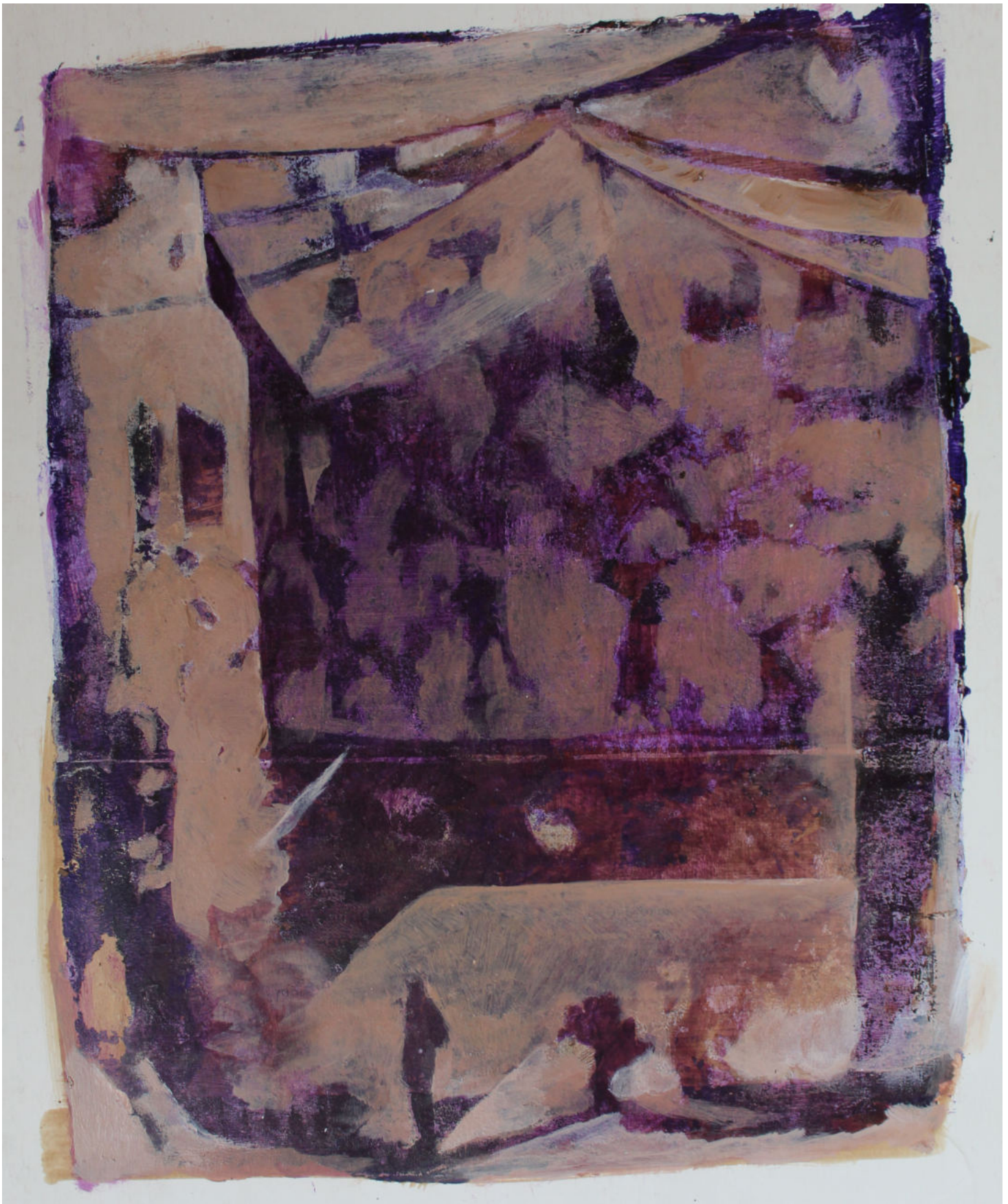
Artist: Ahmed Ali Manganhar Title: Centre of Culture Year: 2023 Medium: Acrylics on paper Size: 10 x 8 inches