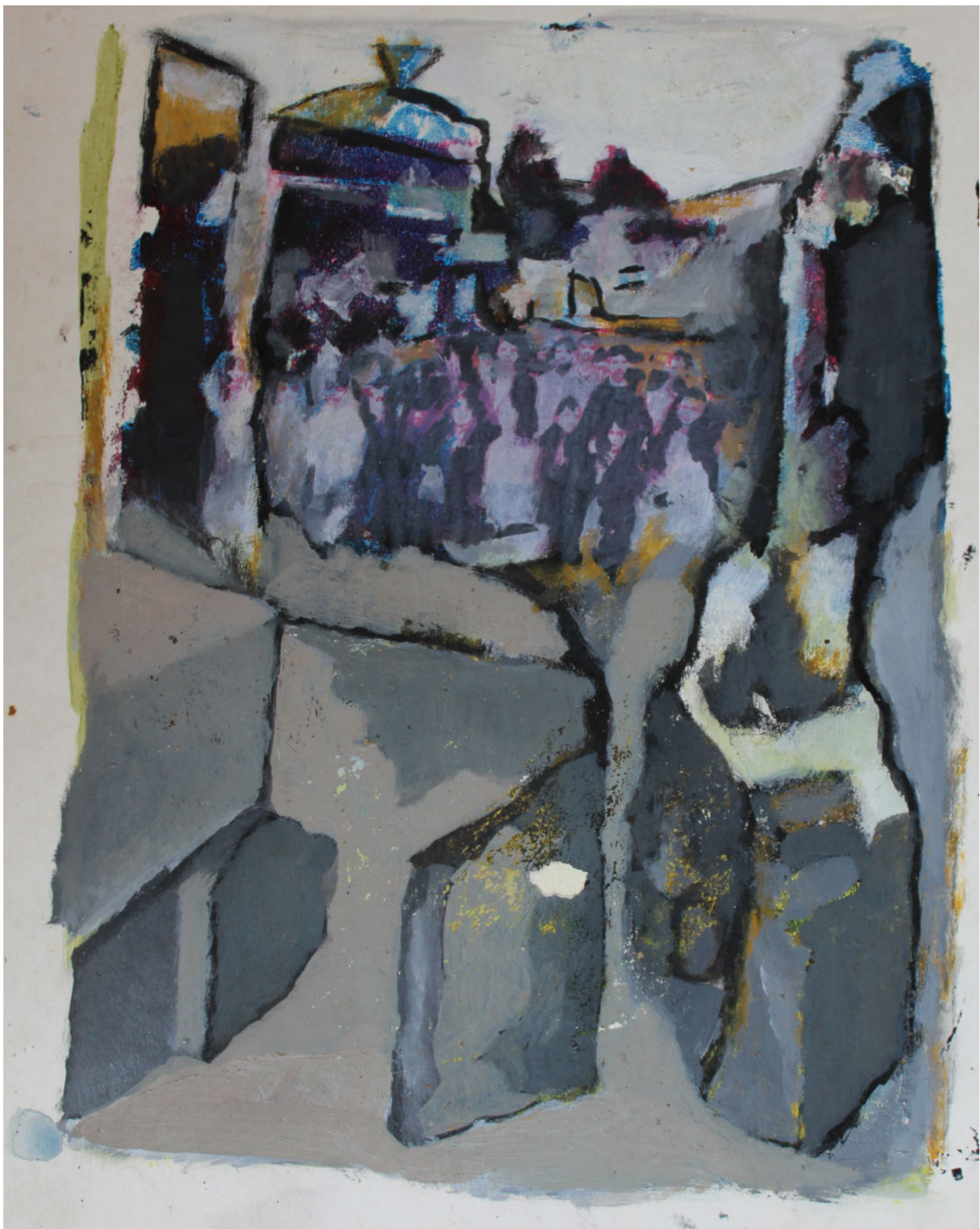
Artist: Ahmed Ali Manganhar Title: A land without a People Year: 2023 Medium: Acrylics on paper Size: 11 x 8 inches