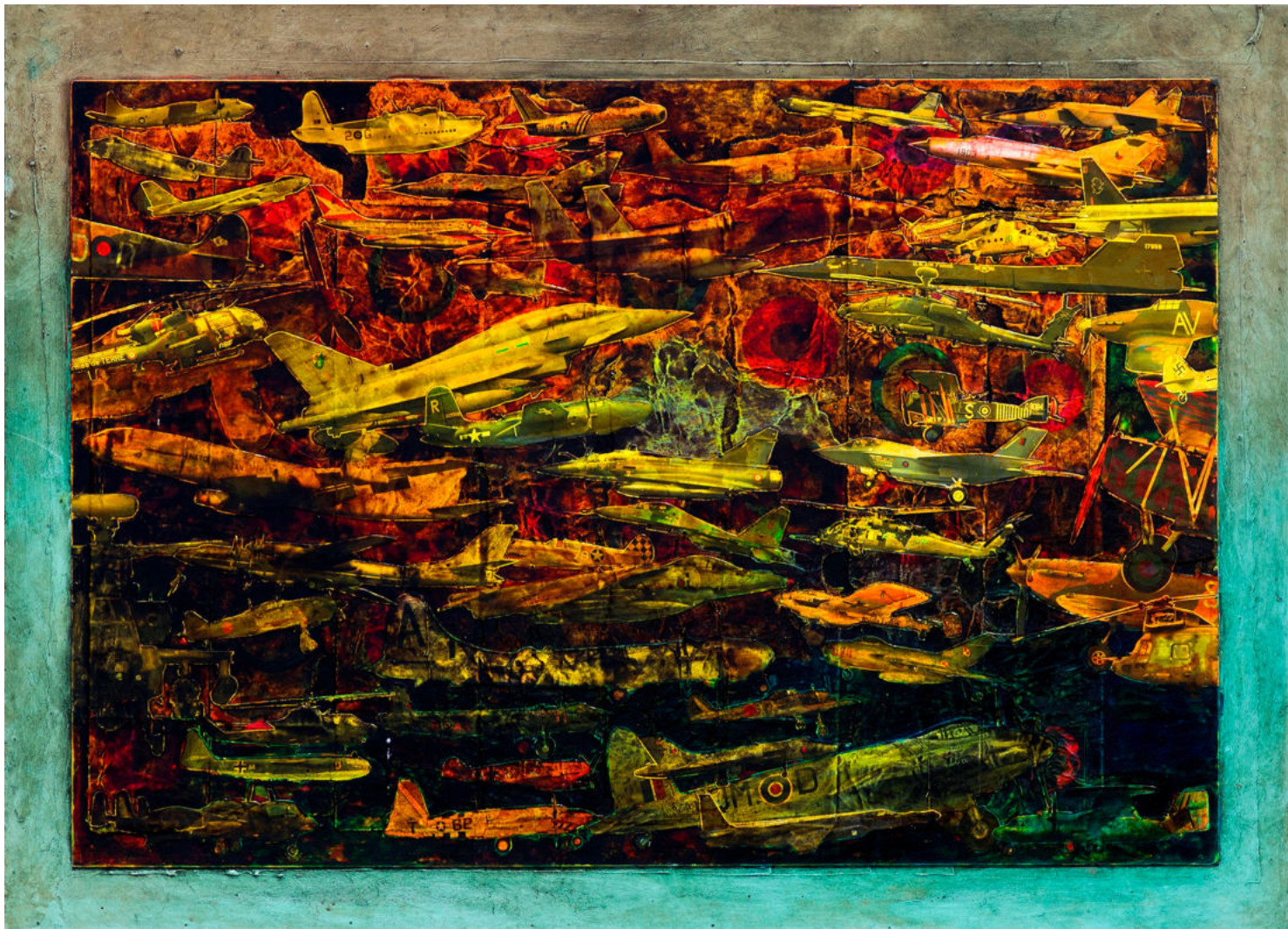
Artist: Afshar Malik Title: Danger Craft and Culture Year: 2019 Medium: Water color inks and collage on board Size: 26 x 36 inches