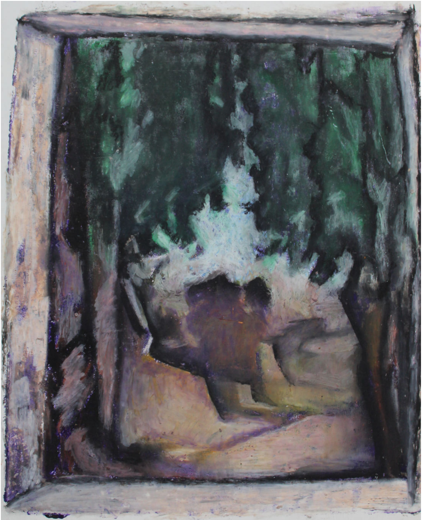
Artist: Ahmed Ali Manganhar Title: View from the window Year: 2023 Medium: Acrylics on paper Size: 10 x 8 inches