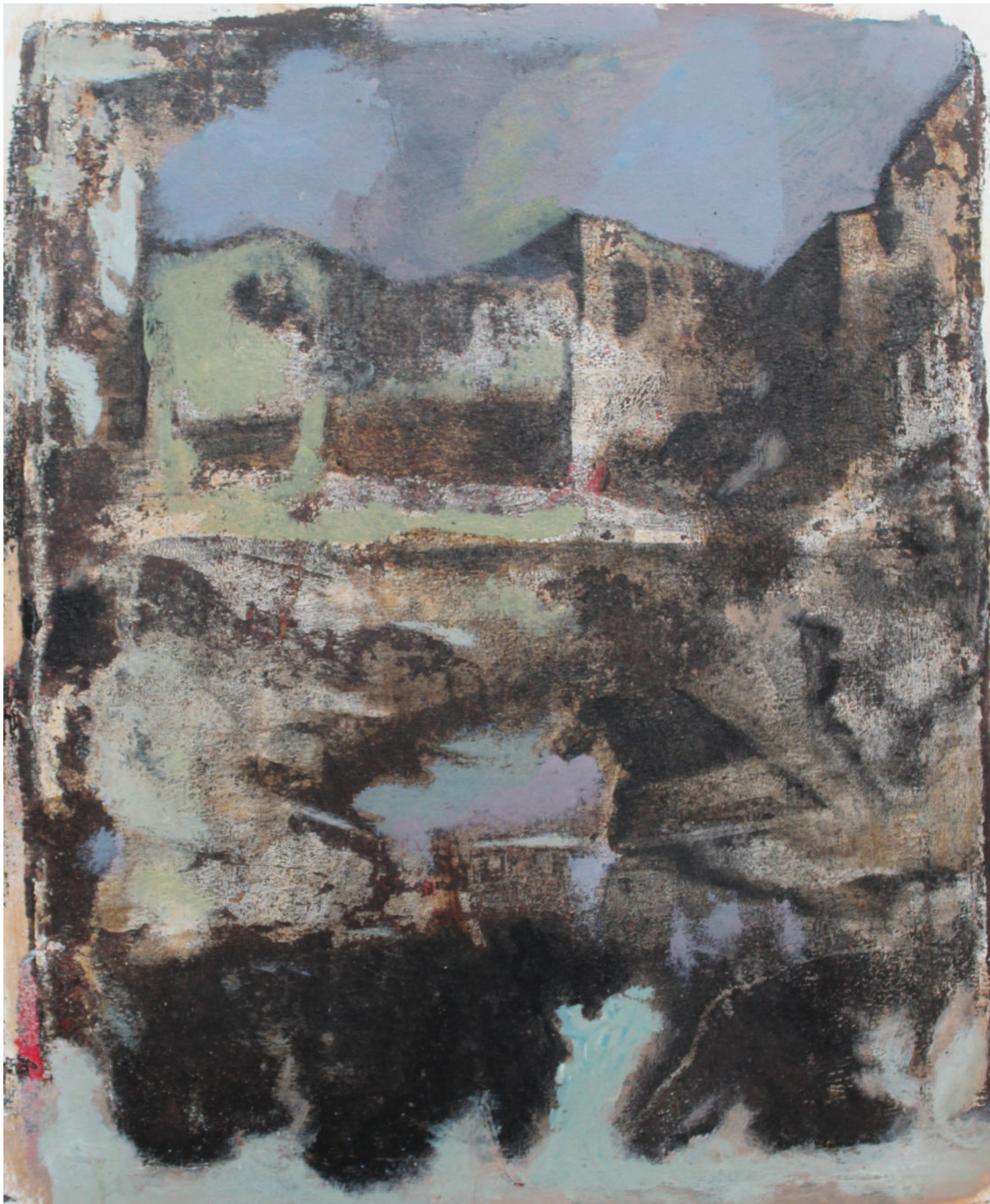
Artist: Ahmed Ali Manganhar Title: Inverted Image Year: 2023 Medium: Acrylics on paper Size: 10 x 8 inches