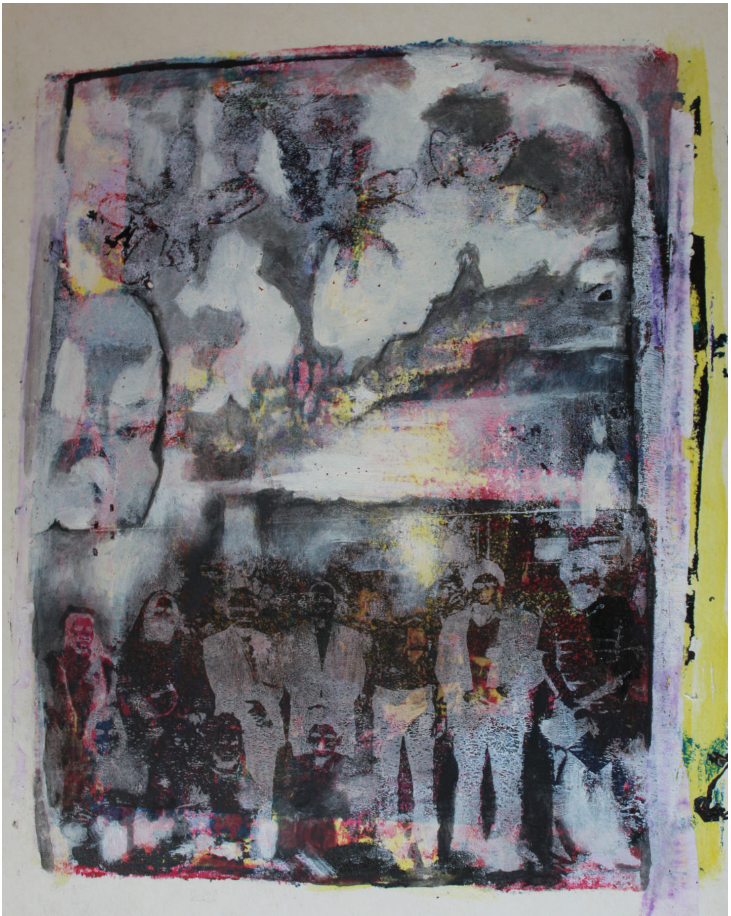
Artist: Ahmed Ali Manganhar Title: The Proprietors Year: 2023 Medium: Acrylics on paper Size: 10 x 8 inches