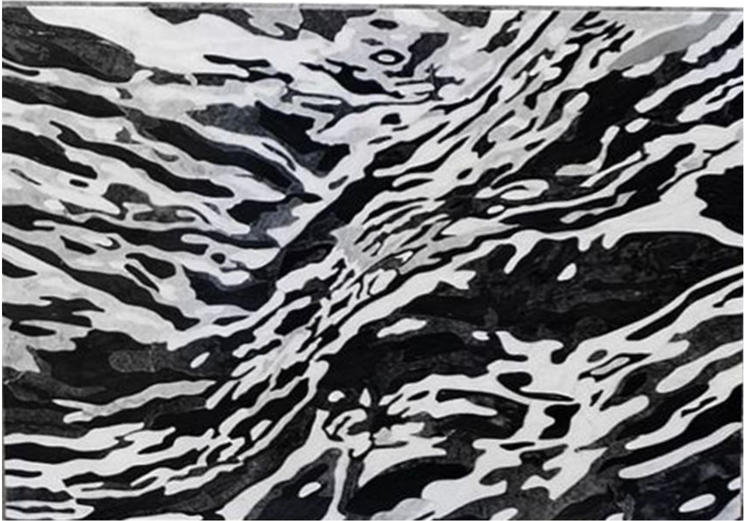
Artist: Hamra Abbas Title: River Studies II Year: 2024 Medium: Marble Size: 30 x 37 inches each