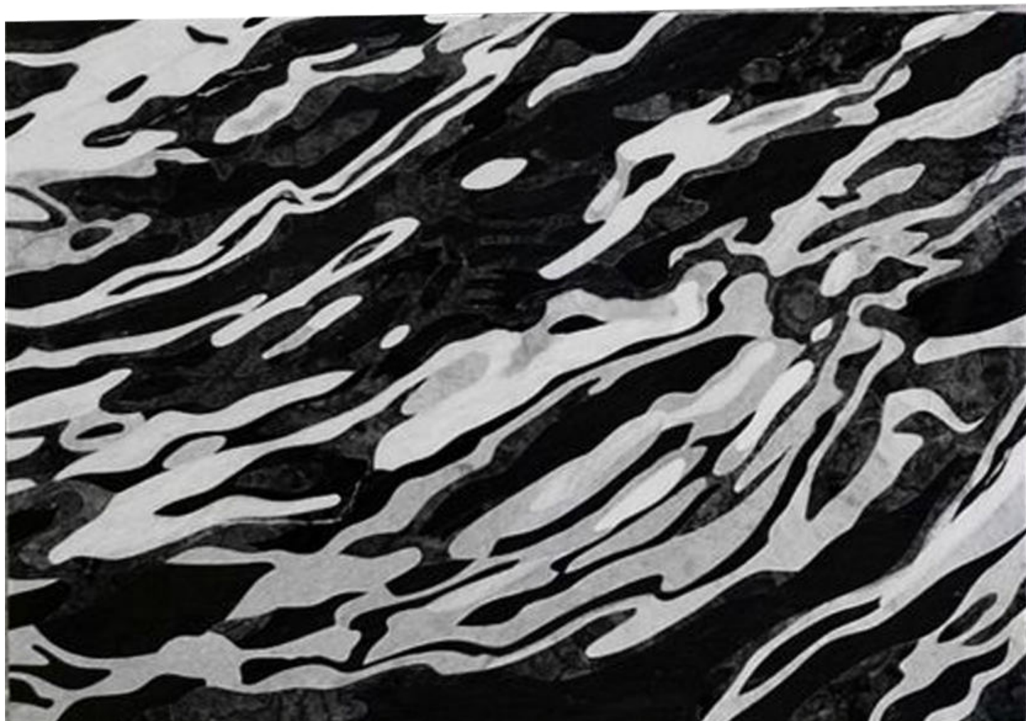
Artist: Hamra Abbas Title: River Studies I Year: 2024 Medium: Marble Size: 30 x 37 inches each