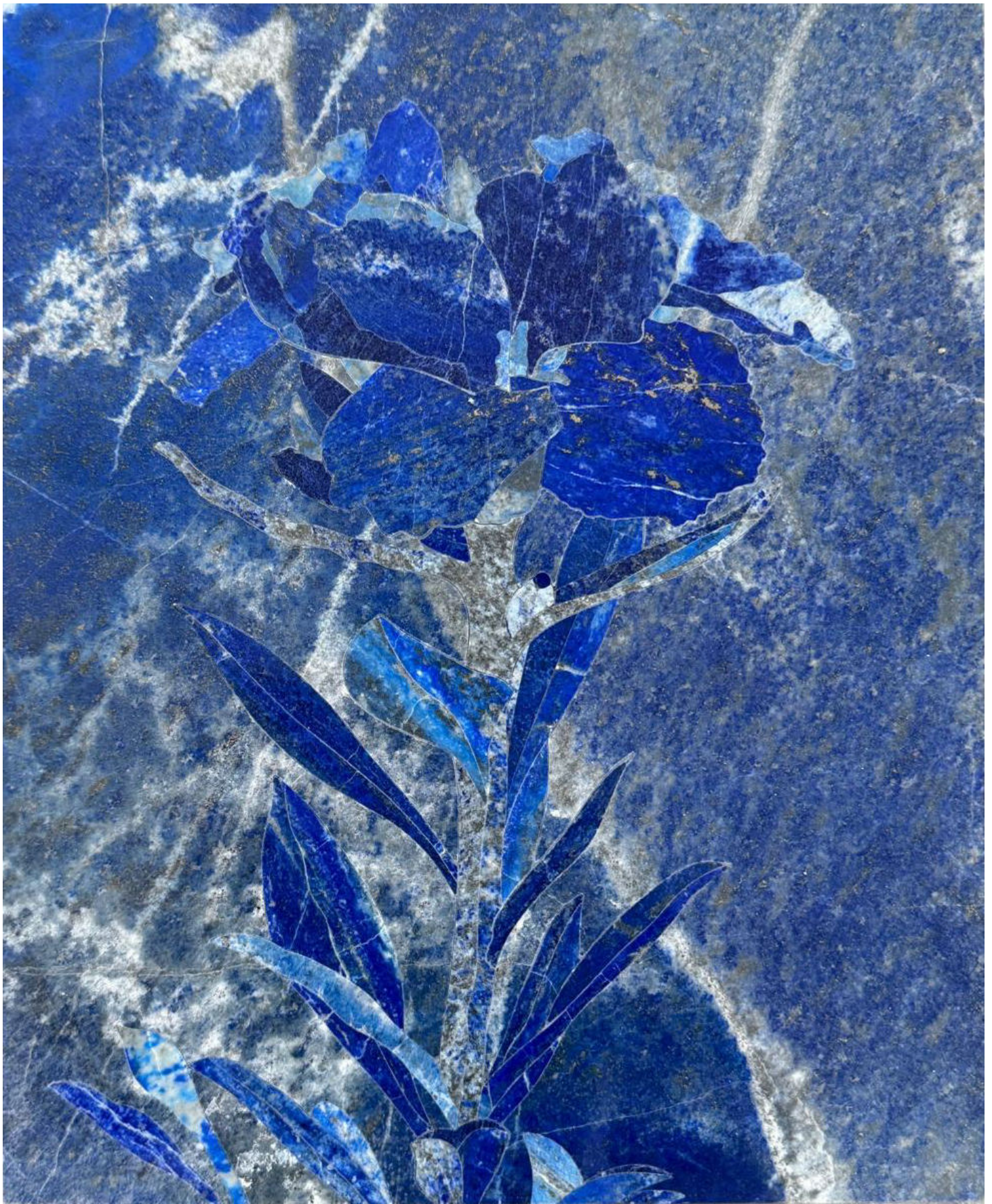
Artist: Hamra Abbas Title: Flower Studies 30 Year: 2024 Medium: Lapis lazuli Size: 9 x 11 inches