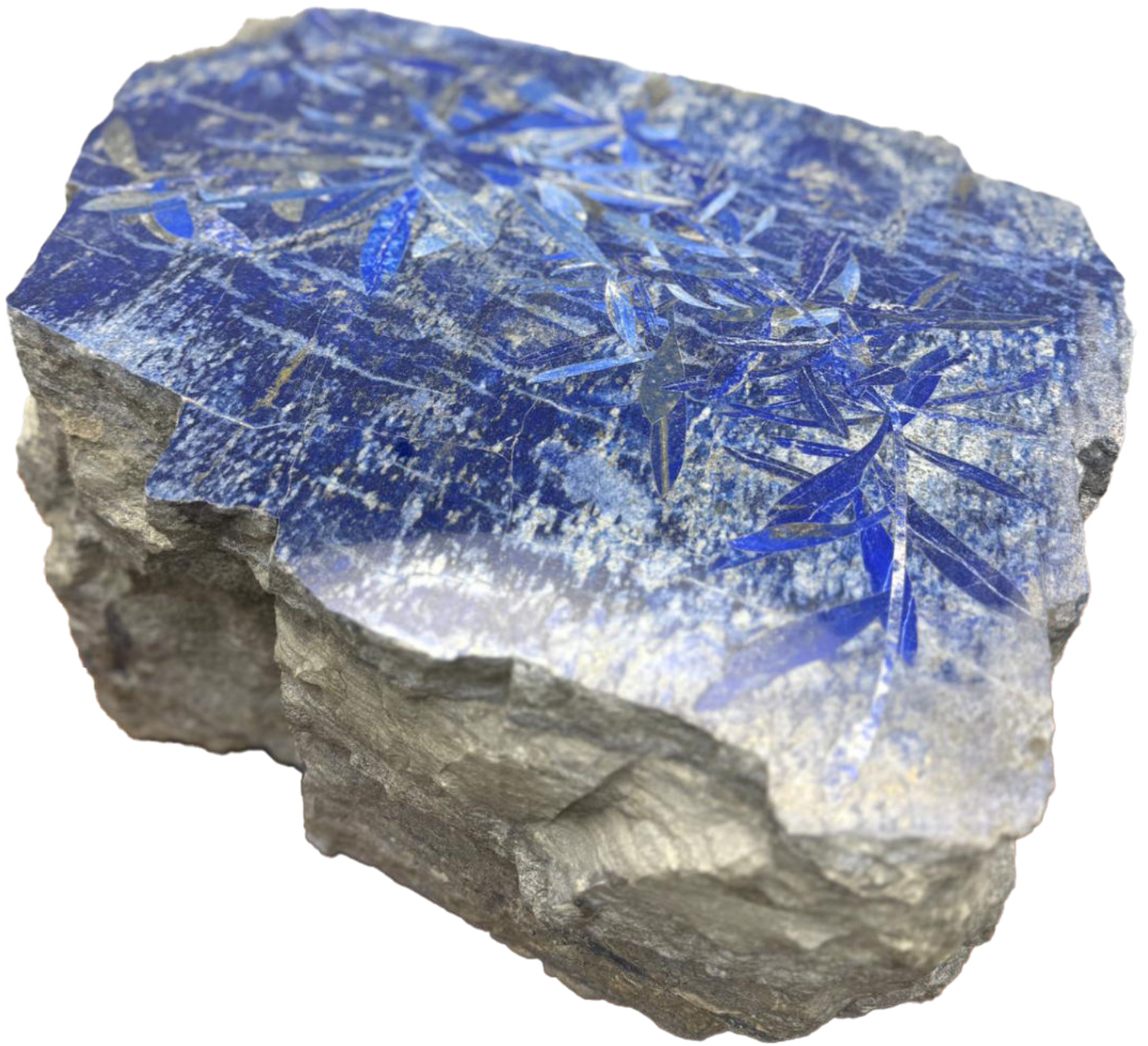
Artist: Hamra Abbas Title: Plant Studies III Year: 2024 Medium: Lapis lazuli Size: Variable