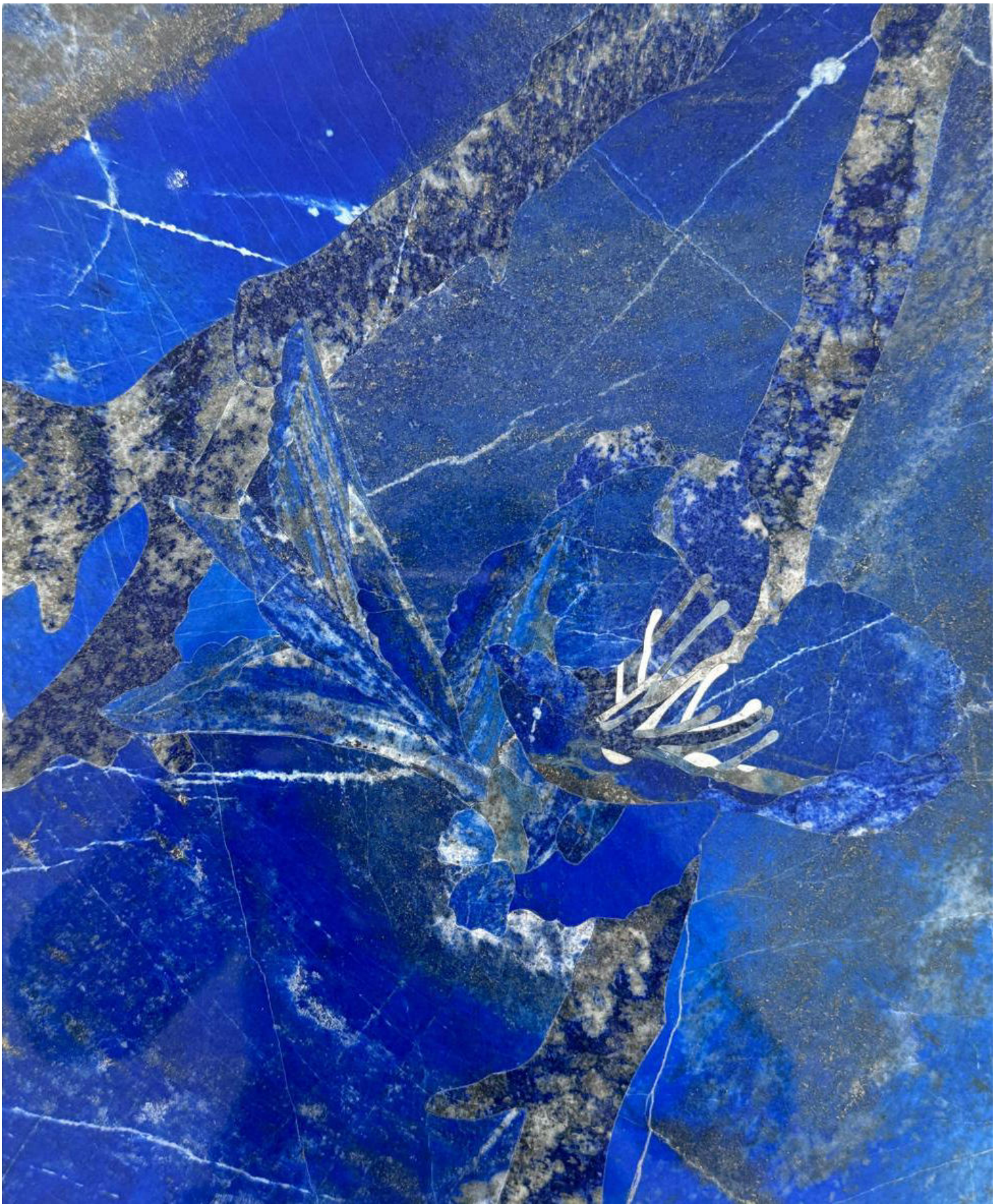
Artist: Hamra Abbas Title: Flower Studies 31 Year: 2024 Medium: Lapis lazuli Size: 9 x 11 inches