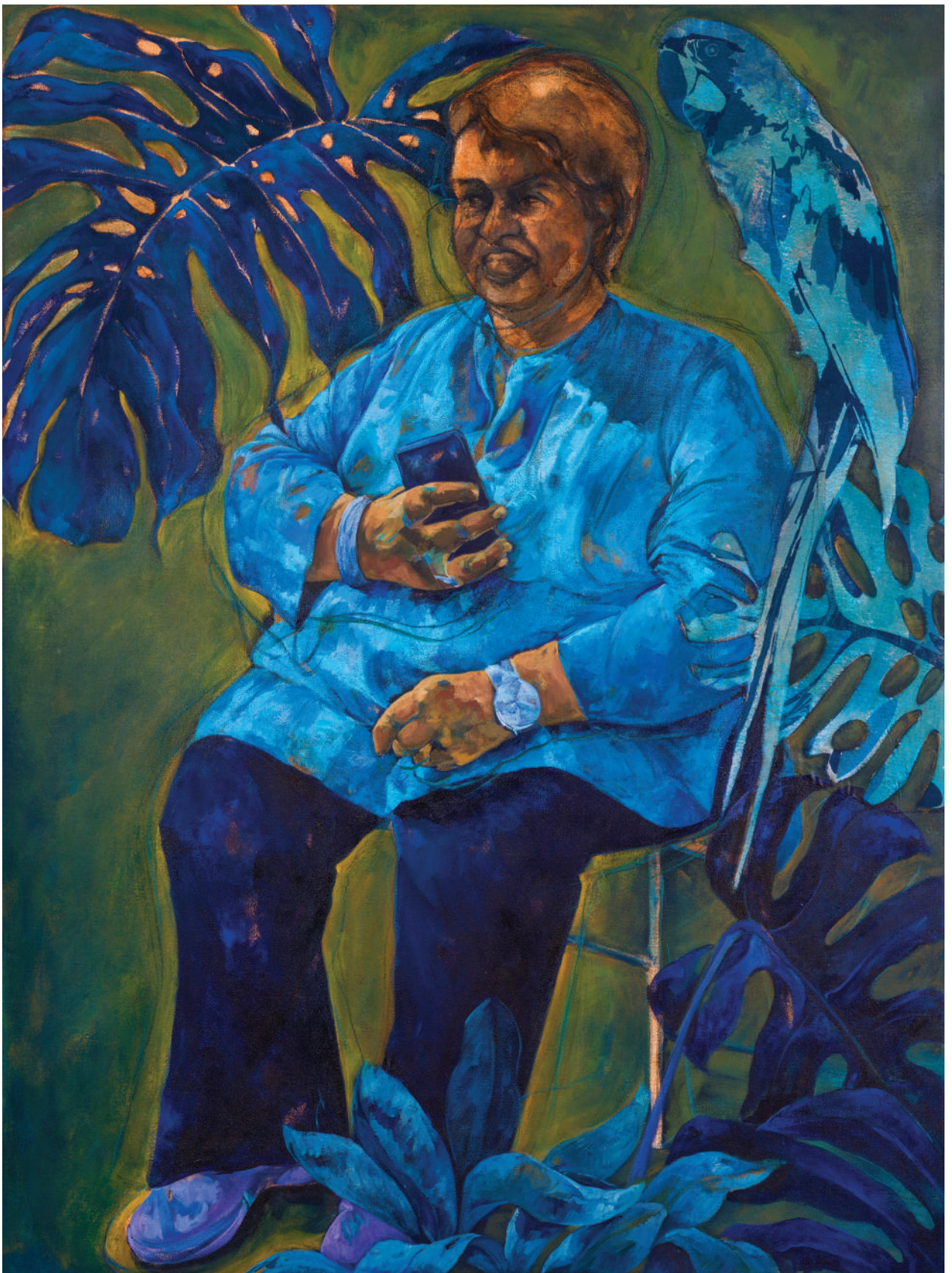
Title: But I Was Always a Storm Medium: Fabric collage, acrylics and charcoal on canvas Size: 36 x 48 inches Year: 2023