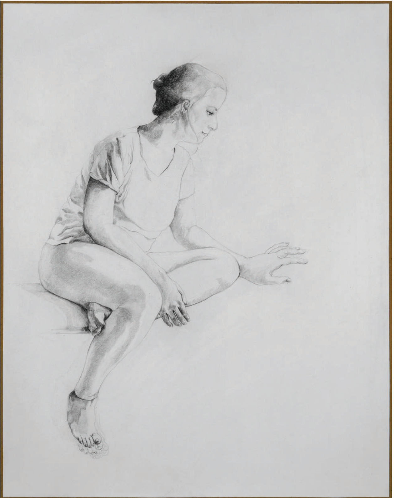
Title: What Matters is What You See Medium: Graphite on wasli Size: 22 x 28 inches Year: 2023