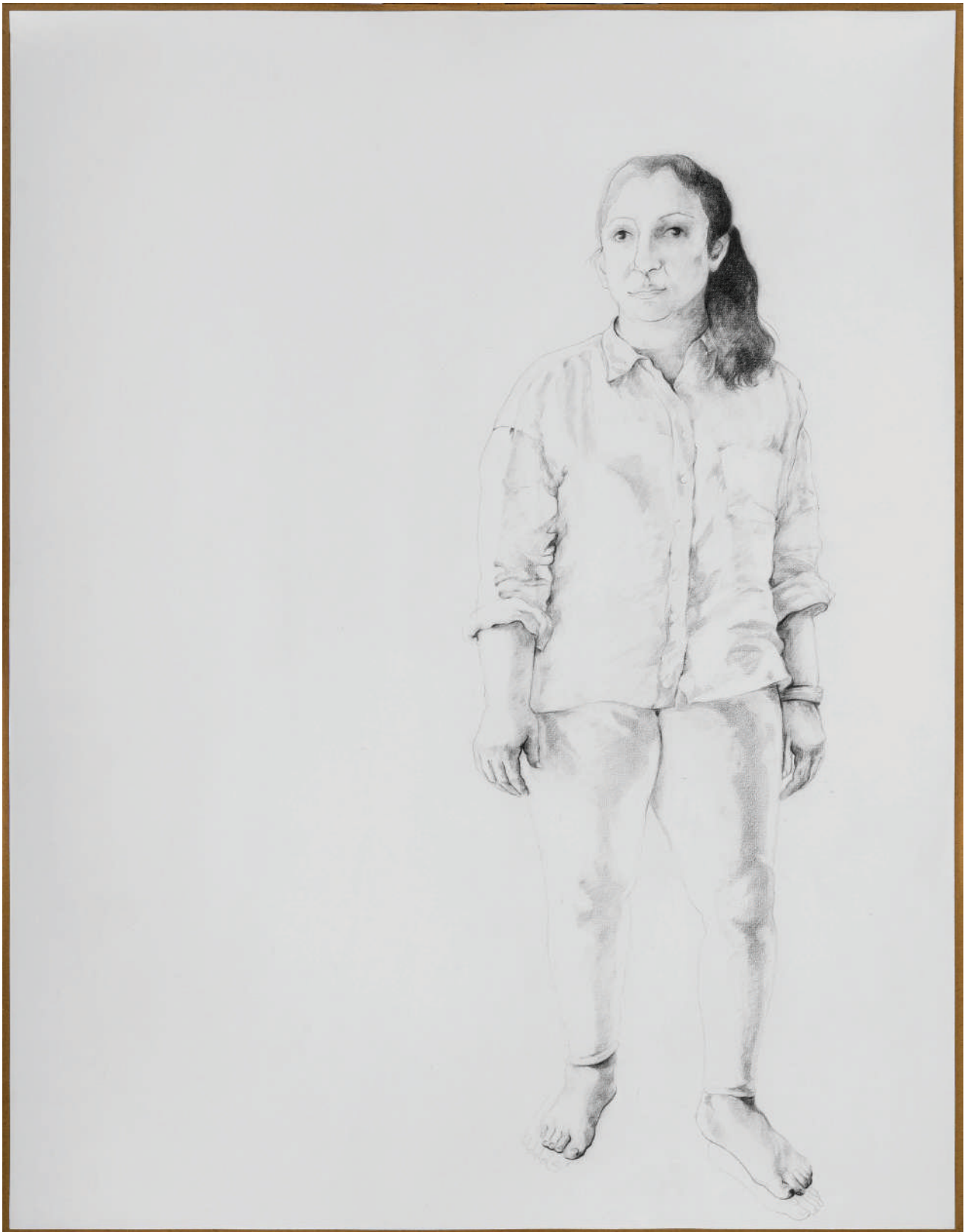
Title: Portrait of a Woman II Medium: Graphite on wasli Size: 22 x 28 inches Year: 2023