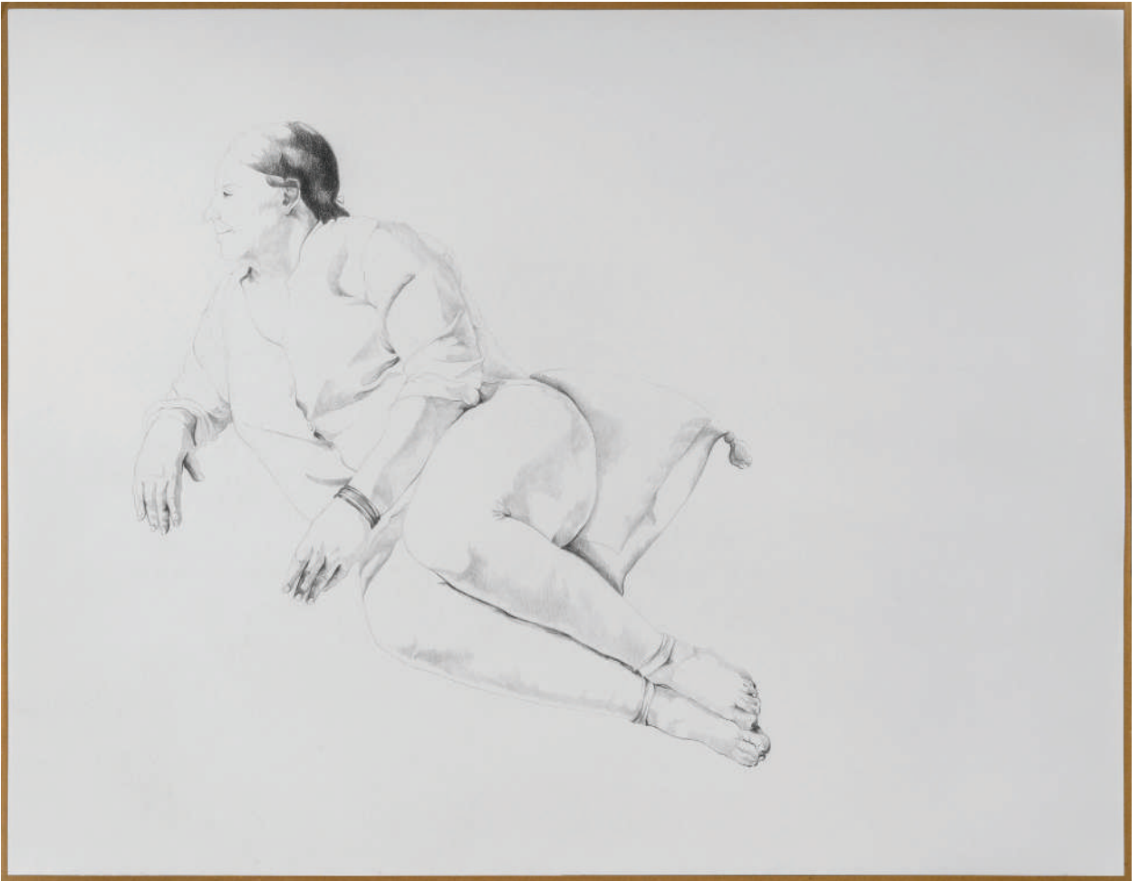
Title: Of Red Bangles Medium: Graphite on wasli Size: 28 x 22 inches Year: 2023