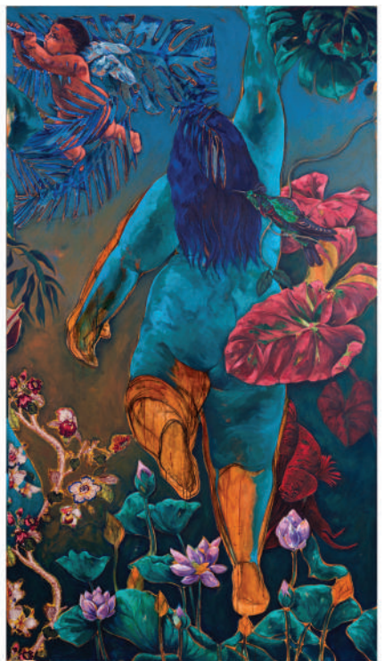
Title: Her Heart Was a Secret Garden Medium: Fabric collage, acrylics and charcoal on canvas Size: 120 x 72 inches Year: 2023