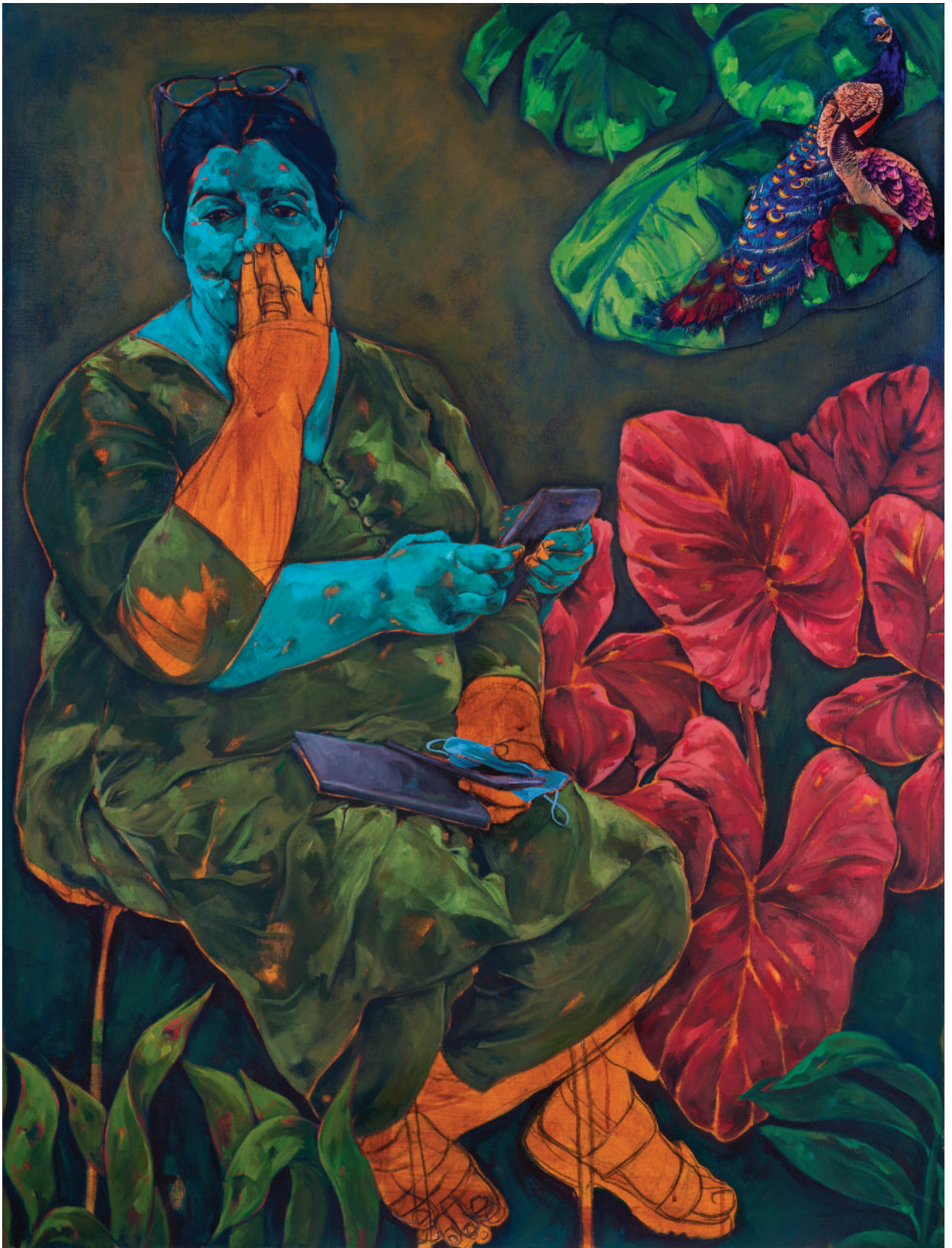
Title: The Most Dangerous Animal is a Woman Smiling Medium: Fabric collage, acrylics and charcoal on canvas Size: 36 x 48 inches Year: 2023