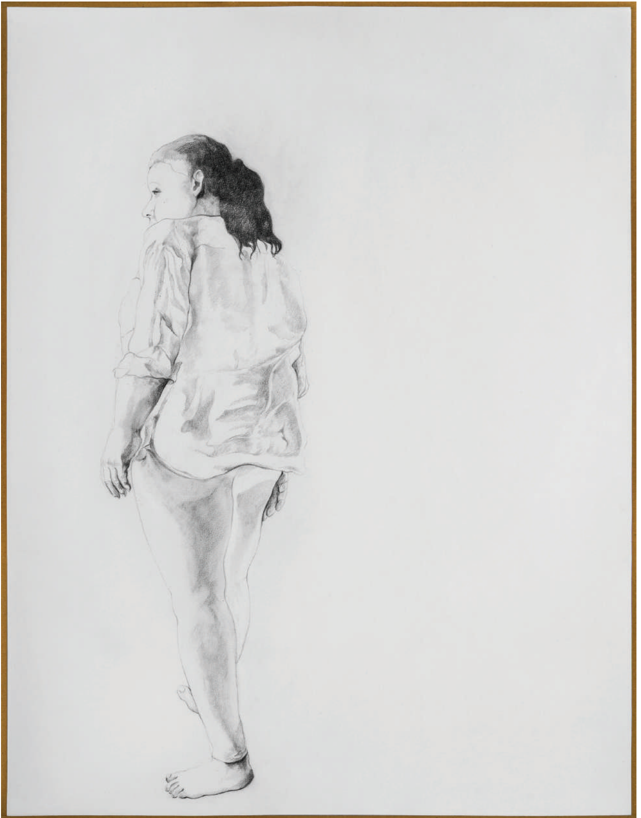
Title: Portrait of a Woman I Medium: Graphite on wasli Size: 22 x 28 inches Year: 2023