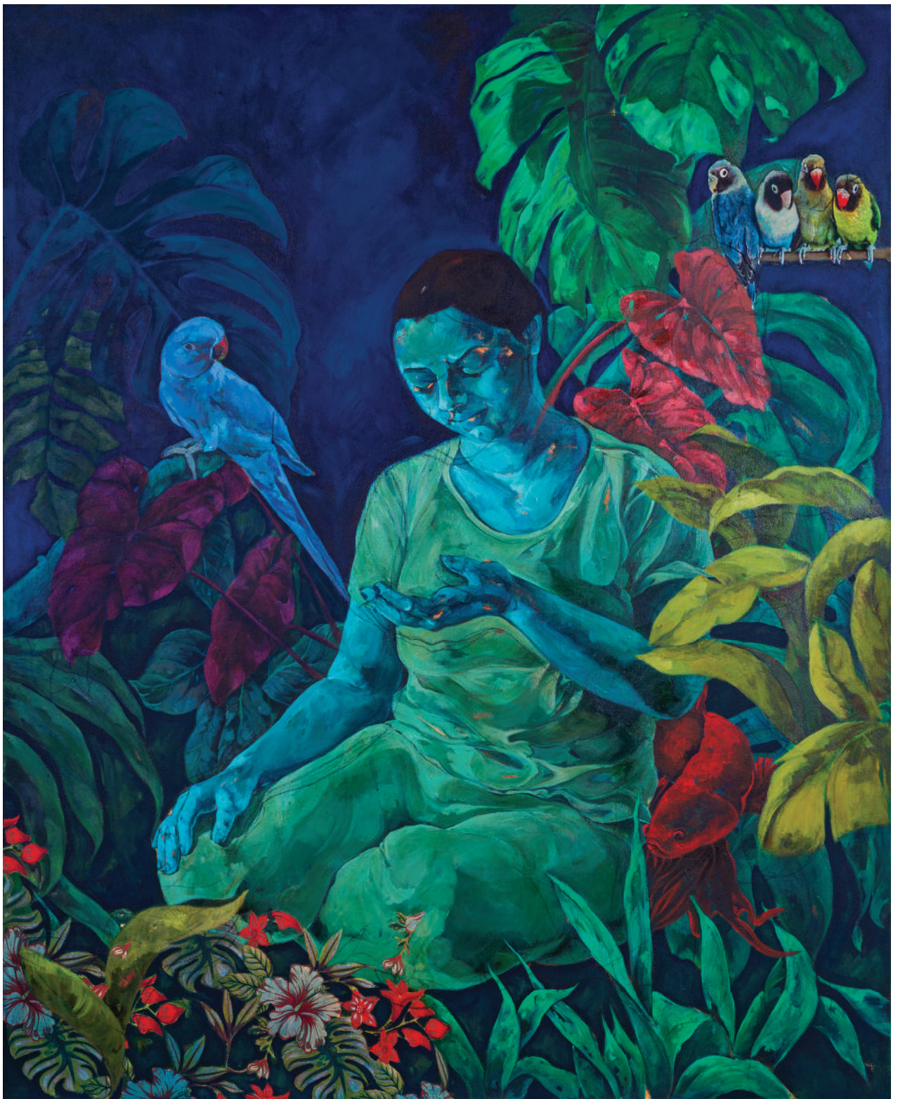
Title: The Red Lines of My Palm Medium: Fabric collage, acrylics and charcoal on canvas Size: 48 x 60 inches Year: 2023