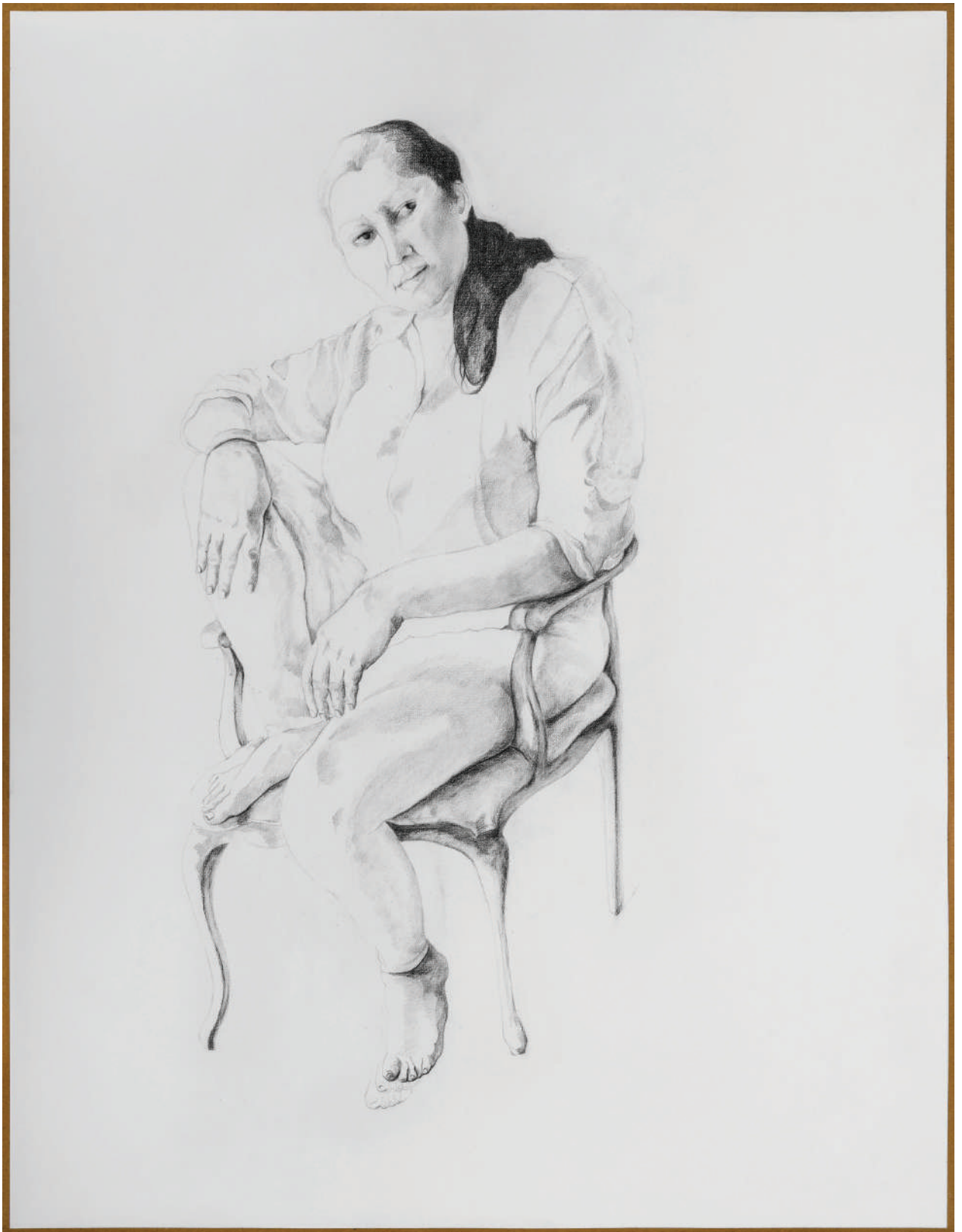
Title: The English Chair Medium: Graphite on wasli Size: 22 x 28 inches Year: 2023