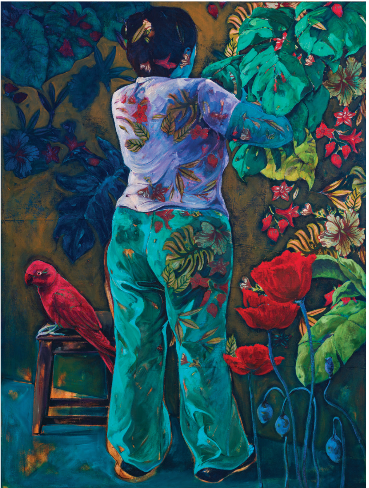
Title: Of Blue Leaves and Red Poppies Medium: Fabric collage, acrylics and charcoal on canvas Size: 36 x 48 inches Year: 2023