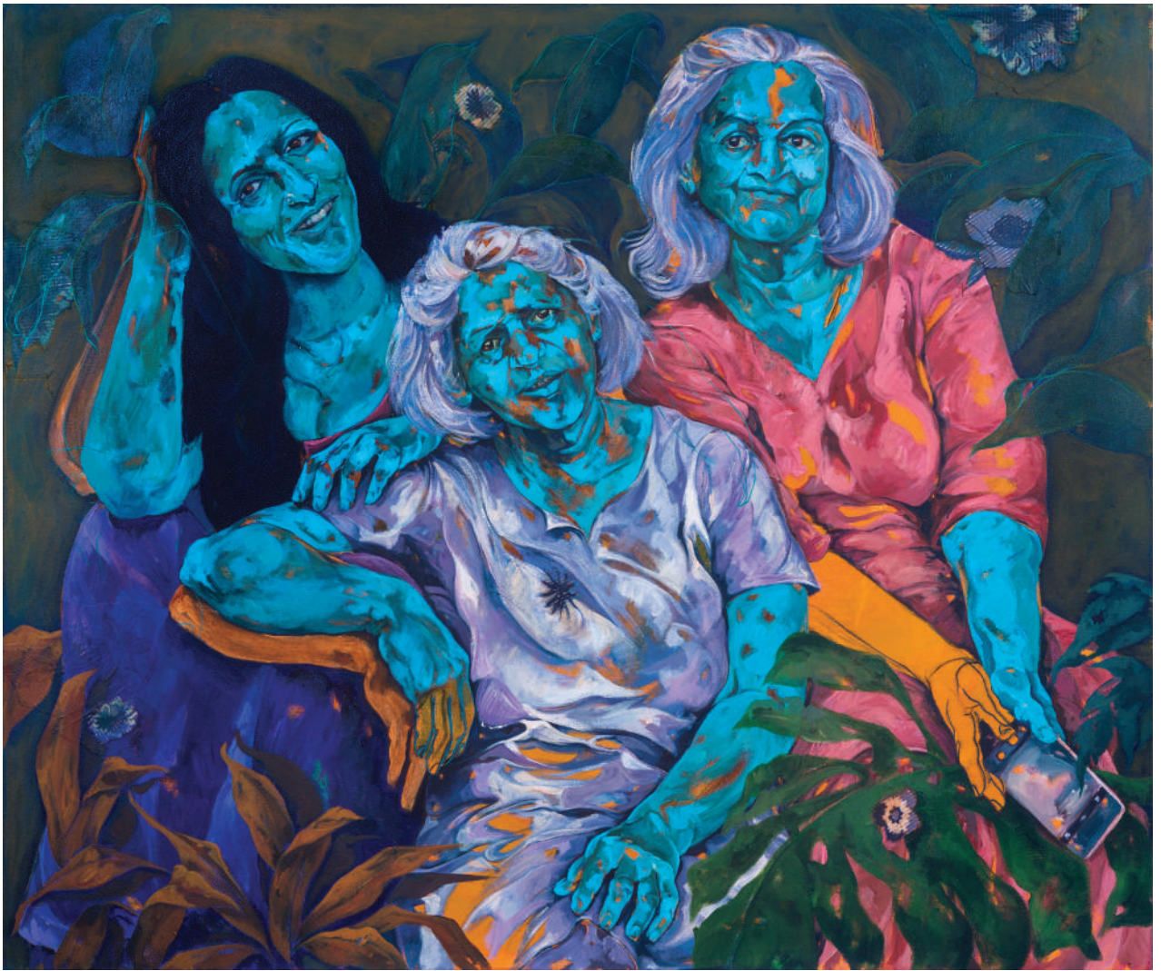
Title: The Unholy Trinity Medium: Fabric collage, acrylics and charcoal on canvas Size: 45 x 38 inches Year: 2023