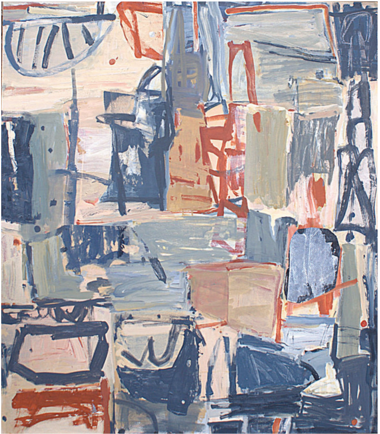
Artist: Shireen Kamran Title: A Fruitful Search Medium: Pigments, acrylics / collage on canvas Size: 48 x 42 Inches Year: 2023