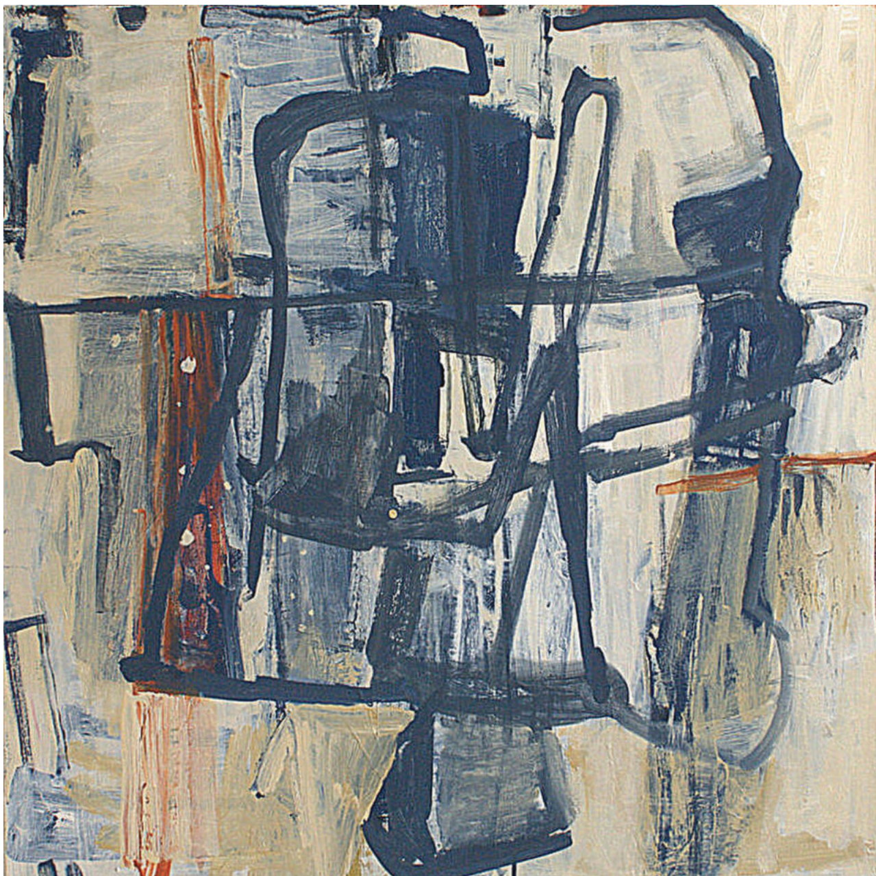
Artist: Shireen Kamran Title: Bast and Qabd Medium: Pigments, acrylics on canvas Size: 33 x 33 Inches Year: 2020