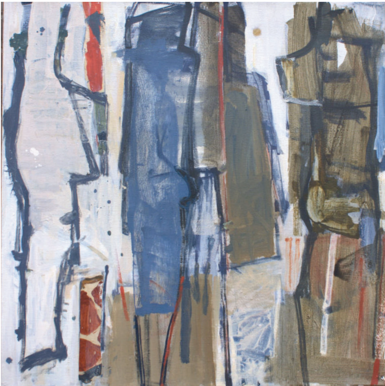
Artist: Shireen Kamran Title: Wanderings / Suluk # 51 Medium: Pigments, acrylics / collage on canvas Size: 36 x 36 Inches Year: 2021