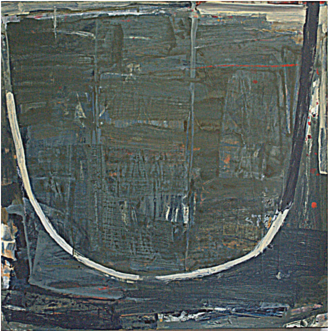
Artist: Shireen Kamran Title: Depth-Marker # 2 Medium: Pigments, acrylics on canvas Size: 24 x 24 Inches Year: 2023