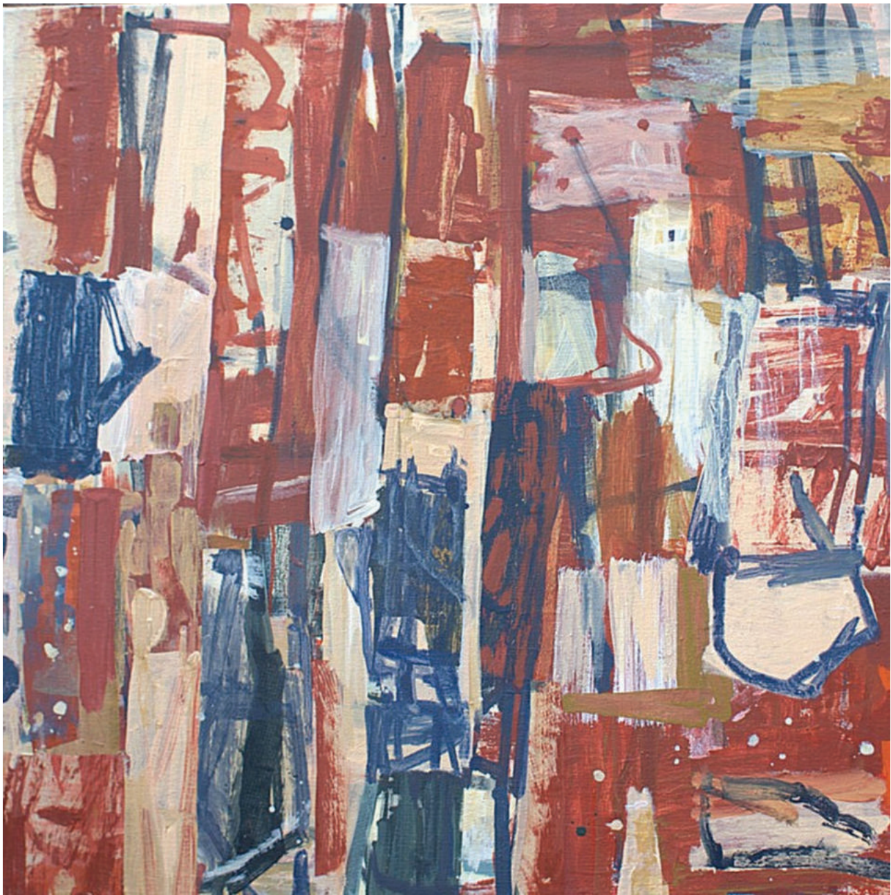
Artist: Shireen Kamran Title: Wanderings / Suluk # 53 Medium: Pigments, acrylics / collage on canvas Size: 36 x 36 Inches Year: 2022