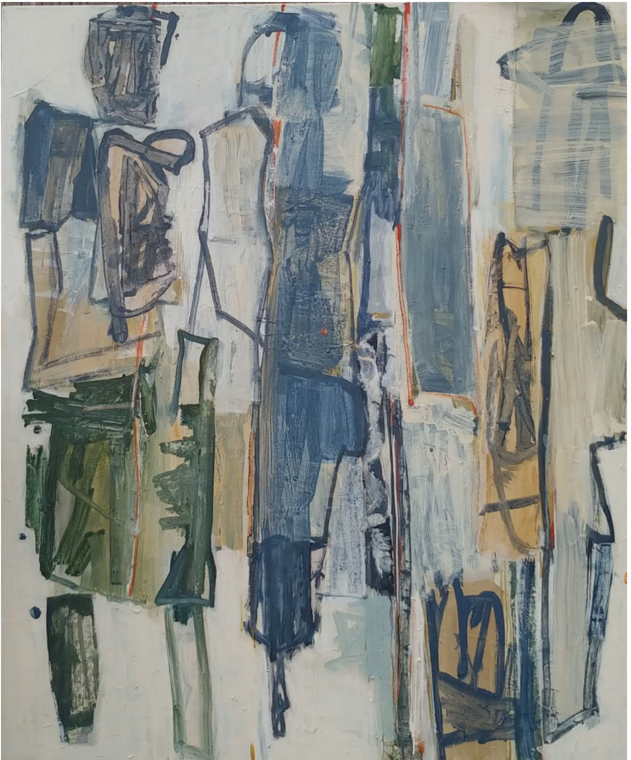
Artist: Shireen Kamran Title: Wanderings / Suluk # 56 Medium: Pigments, acrylics / collage on canvas Size: 60 x 50 Inches Year: 2021