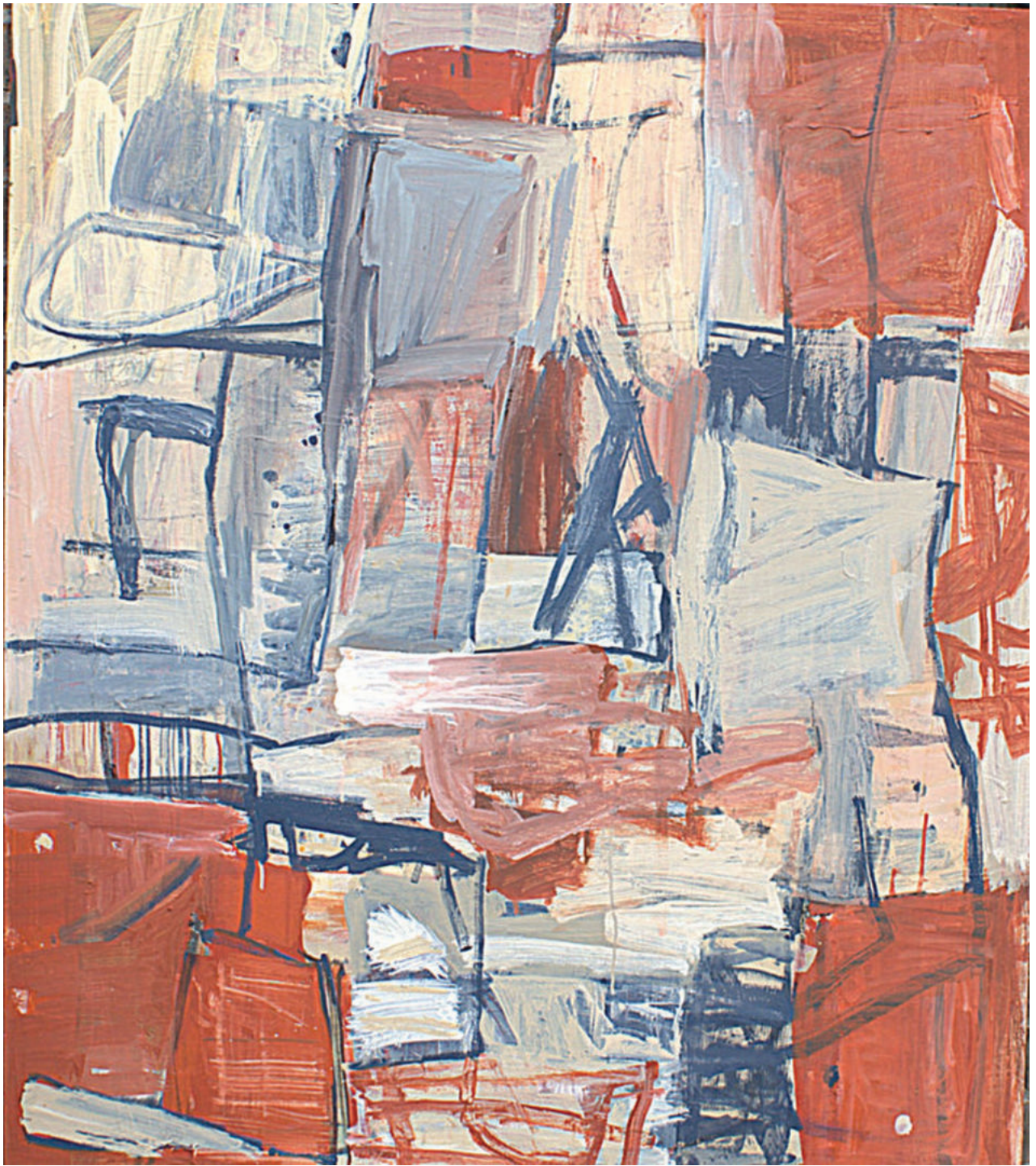
Artist: Shireen Kamran Title: In My Element Medium: Pigments, acrylics / collage on canvas Size: 48 x 42 Inches Year: 2023