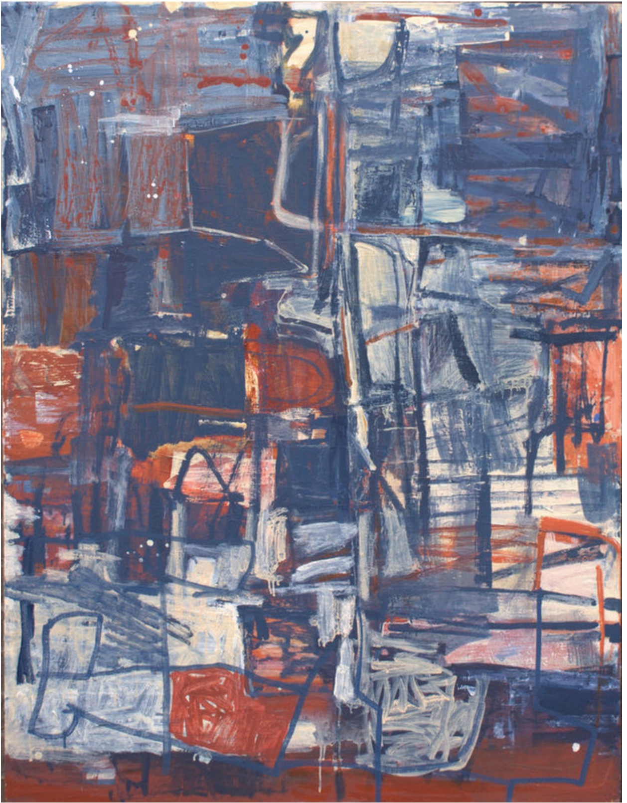
Artist: Shireen Kamran Title: The Path Medium: Pigments, acrylics / collage on canvas Size: 60 x 46 Inches Year: 2022