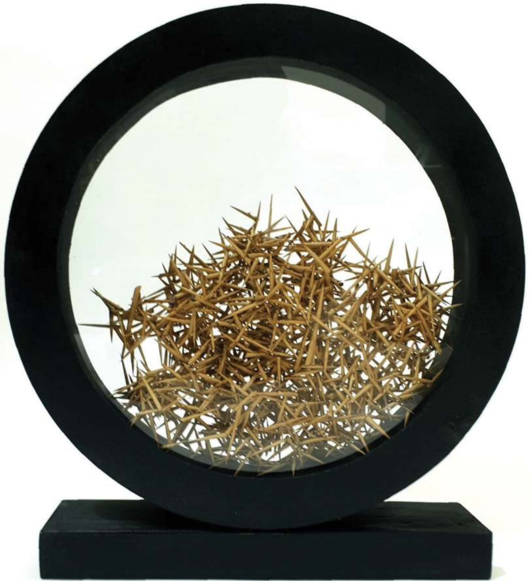
Title: Untitled Medium: Thorns in a Box Size: 15 x 16 x 3 Inches Year: 2023