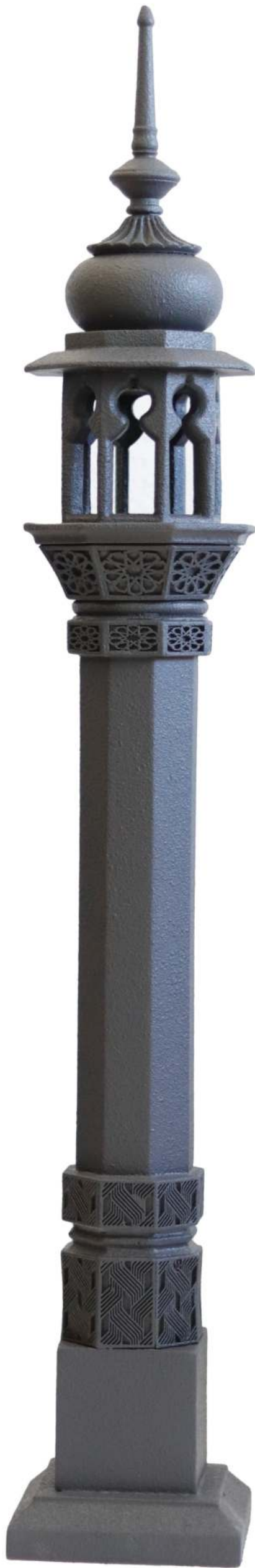
Title: The Belief Beyond V Medium: Deco Paint on HDF, Ply and Wood Size: 34 x 5 x 5 Inches Year: 2023