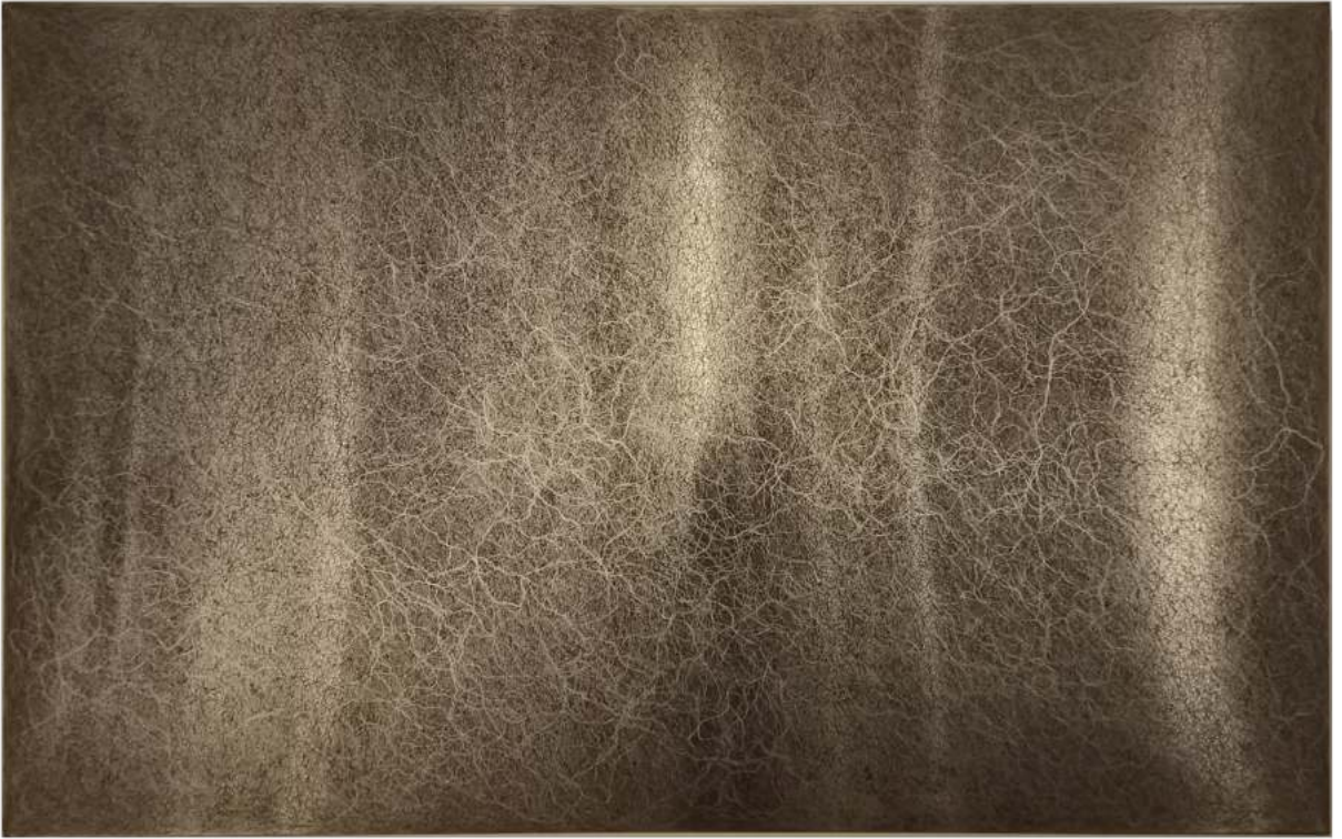
Title: Untitled I Medium: Stainless Steel Size: 40 x 60 Inches Year: 2023