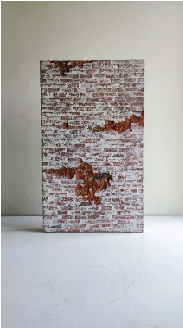
Title: Scars I can't Hide I Medium: Terracotta Bricks, Concrete and Paint Size: 16 x 9 x 2 Inches Year 2023