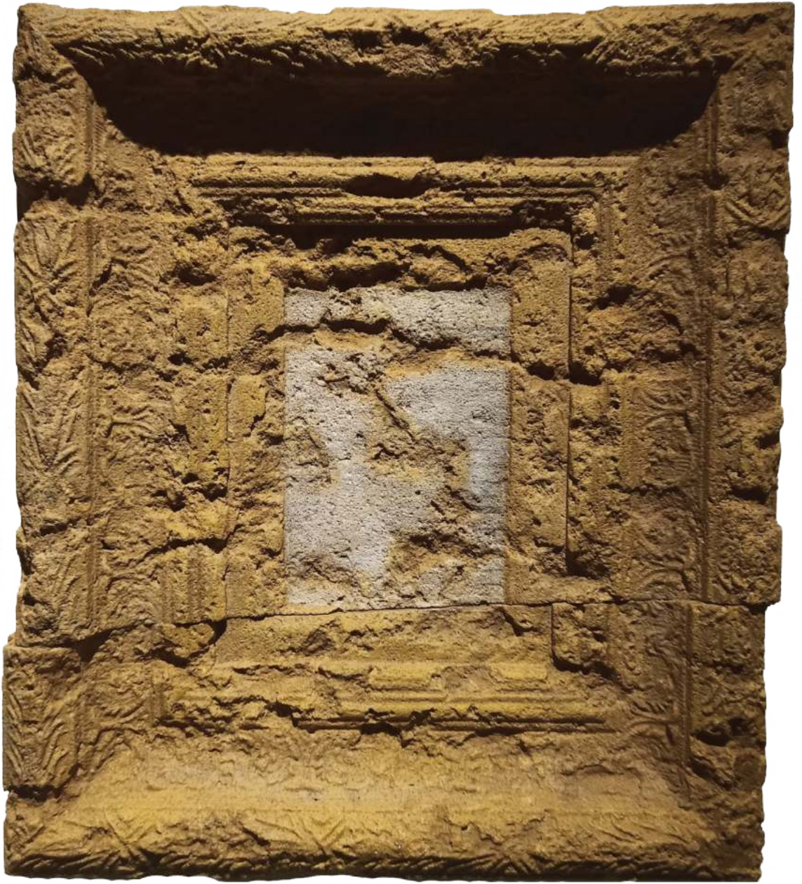
Title: Where Lays My Soul II ? Medium: Sand Stone, Paint and Fiberglass Size: 17 x 15 x 2 Inches Year: 2023