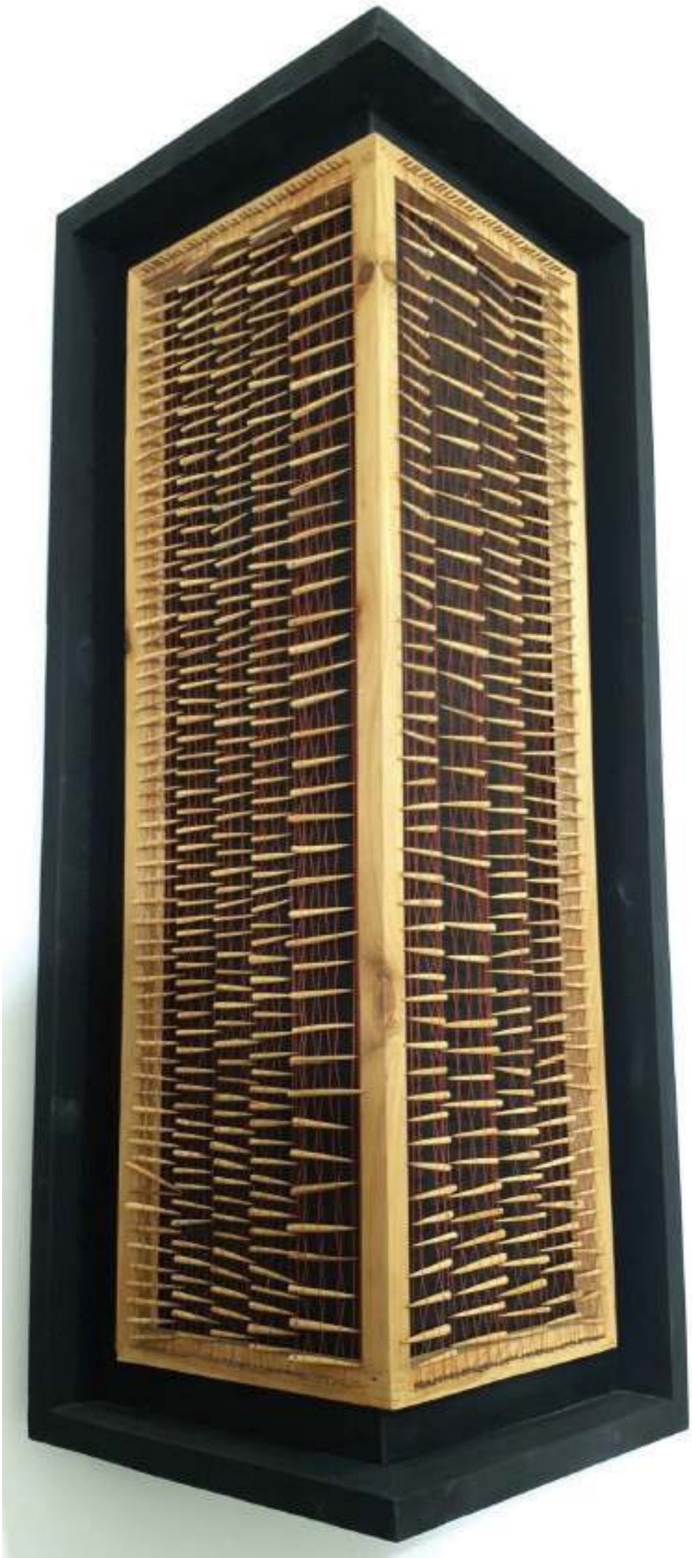
Title: Black Carpet Medium: Thorn with Thread Size: 19 x 23 Inches Year: 2023