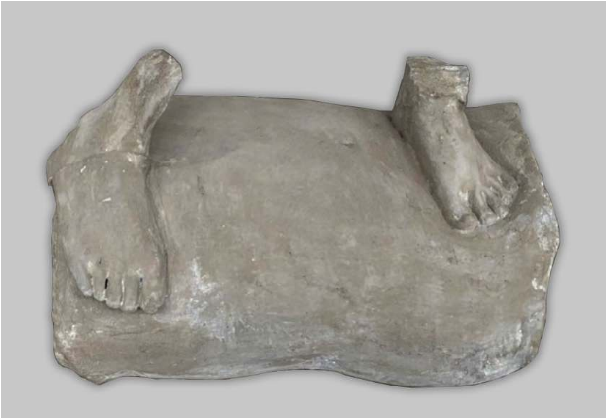
Title: Untitled Medium: Reinforced Concrete Size: 12 x 24 x 20 Inches Year: 2021