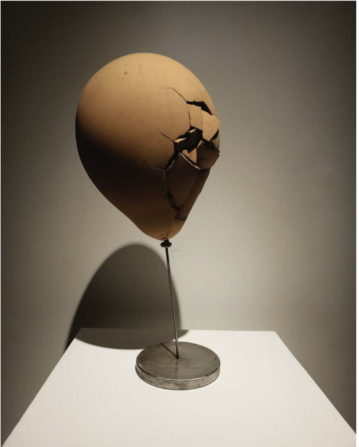
Title: "Fee Ul Hakeekat Feel Khe Saja Sujjarun" * فِي الْحَقِيقَةِ فِئِلْ كِي ، سَجَا سِجَارُنْ Medium: Terracotta Size: 8 x 8 x 18 Inches Year: 2023