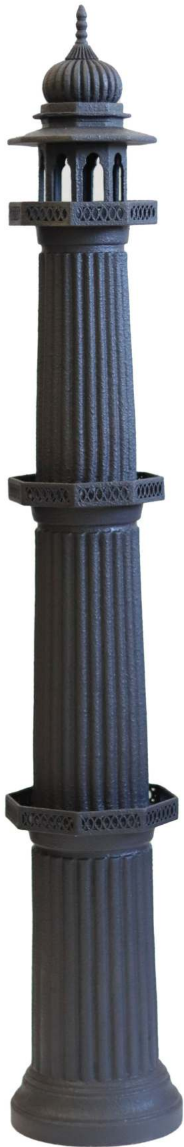
Title: The Belief Beyond III Medium: Deco Paint on HDF, Ply and Wood Size: 31 x 5 (Diameter) (Inches) Year: 2023