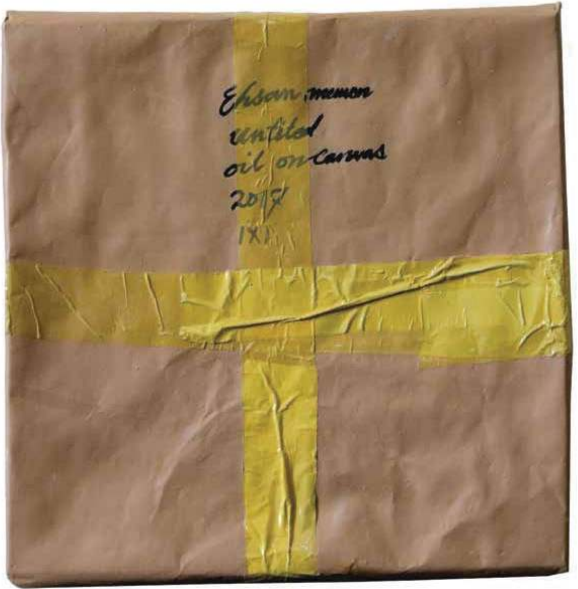
Title: Untitled Medium: Oil on Fiberglass Size: 12 x 12 Inches Year: 2017