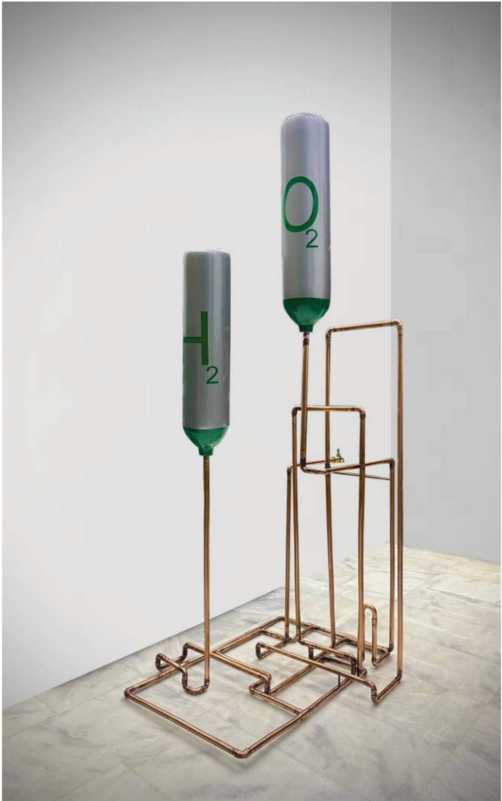
Title: "Eho ko Beyo Feham" * اهو ڪو ٻيو فھم Medium: Copper, brass and Fiberglass Size: 65 x 36 x 24 Inches Year: 2023