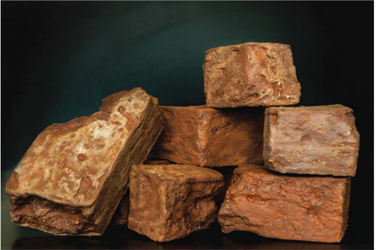
Title: Memories of Home Medium: Fiberglass Cast of Bricks Size: Variable Year: 2016