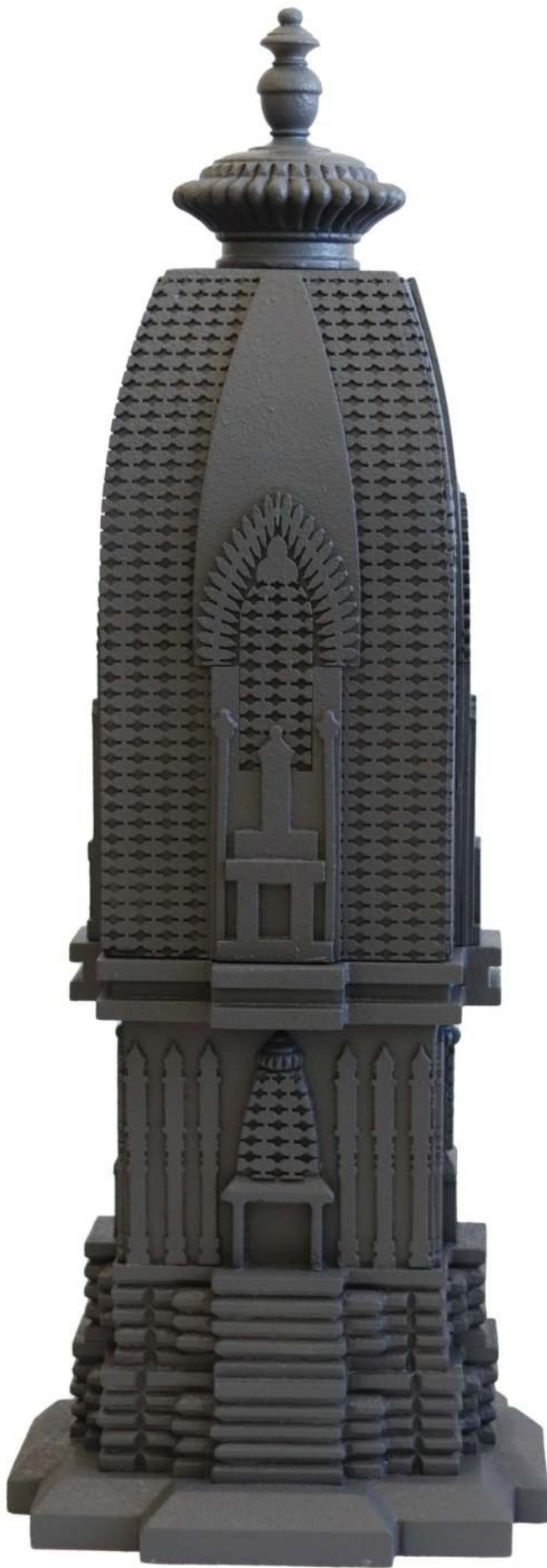
Title: The Belief Beyond I Medium: Deco Paint on HDF, Ply and Wood Edition: 1/2 + AP Size: 36 x 11 x 11 Inches Year: 2023