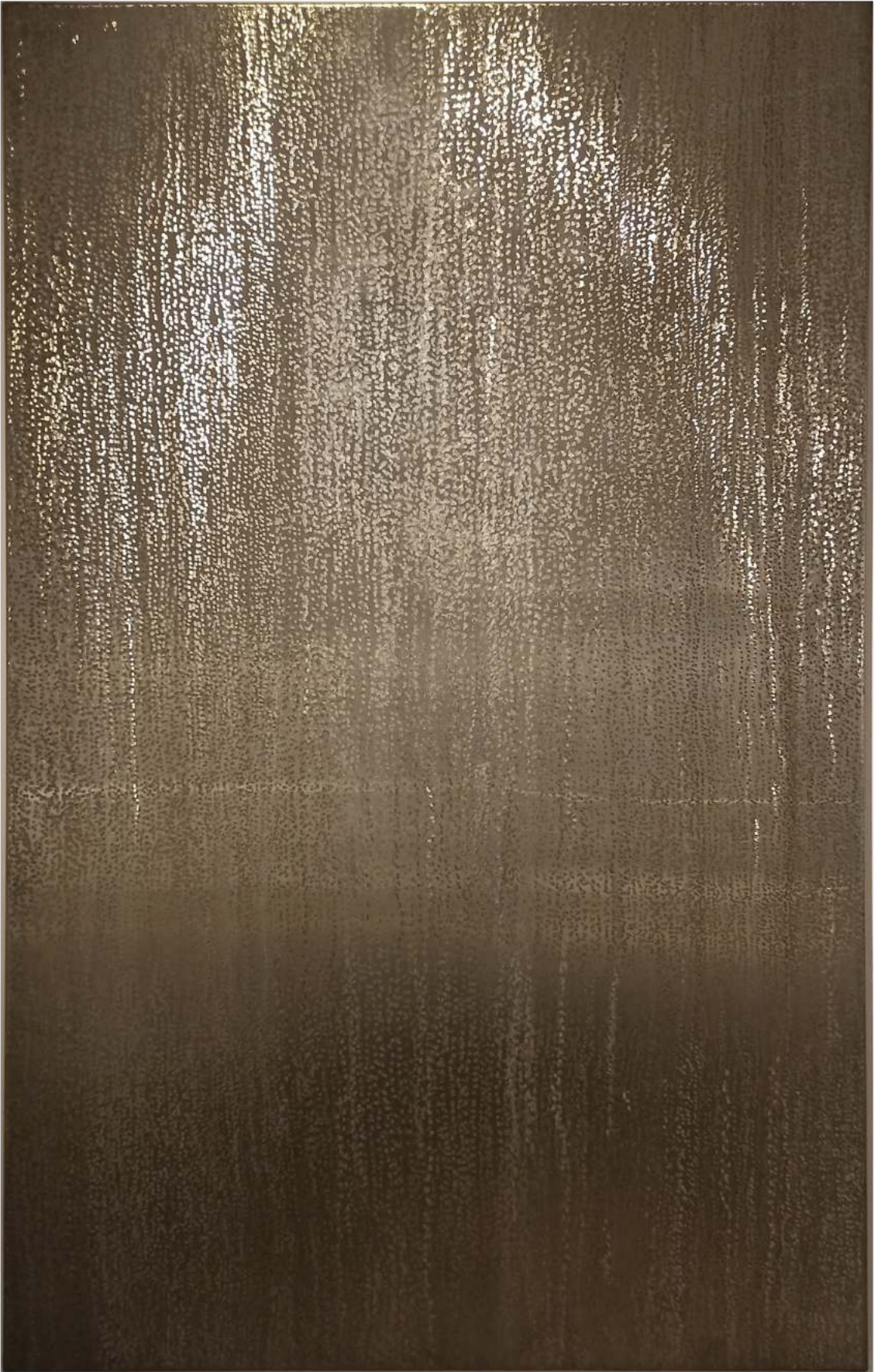
Title: Untitled II Medium: Stainless Steel Size: 73 x 45 Inches Year: 2023