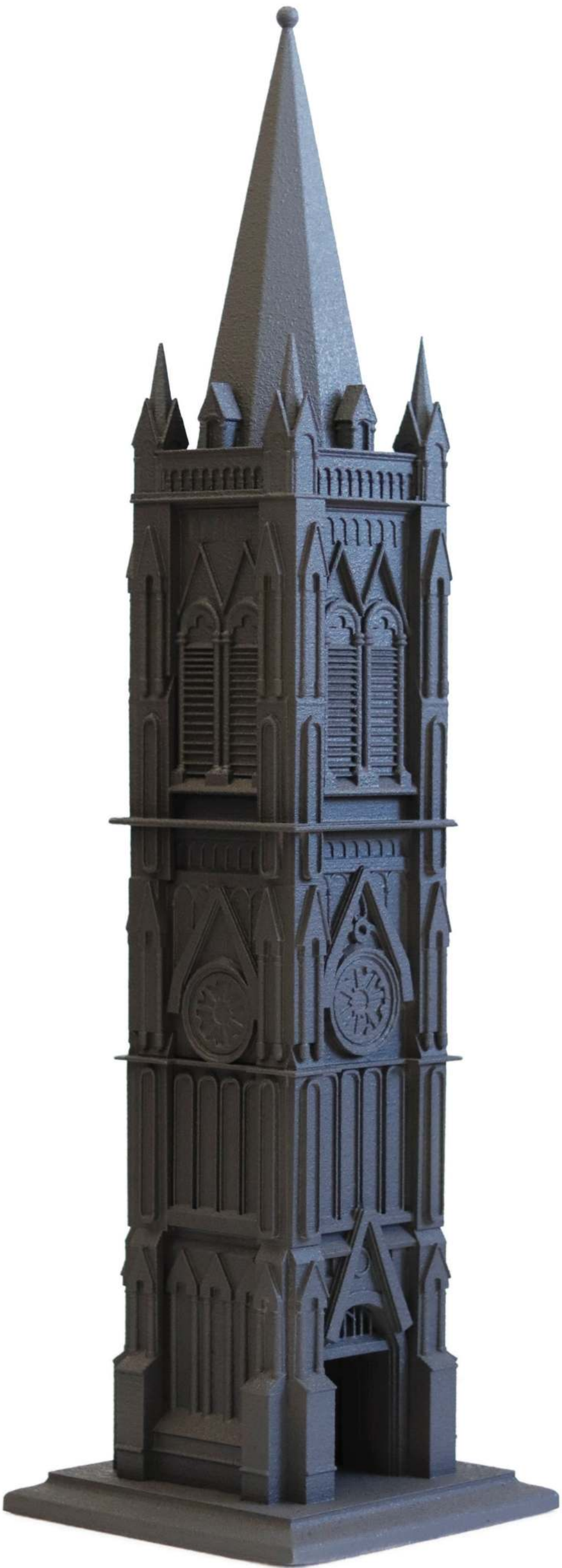
Title: The Belief Beyond VI Medium: 3D Printed and Deco Paint Edition: 1/2 + AP Size: 30 x 8 x 8 Inches Year: 2023