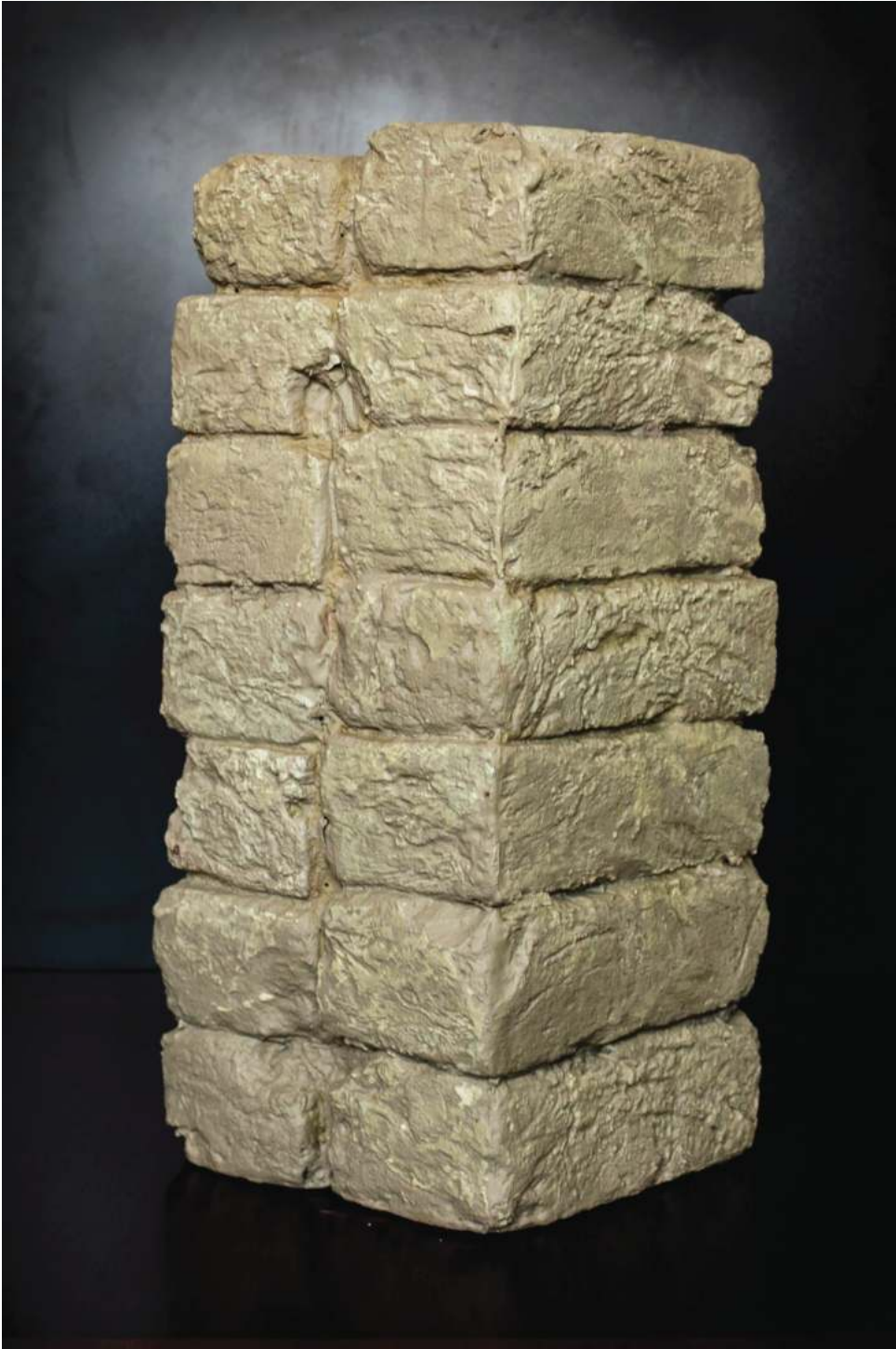
Title: Part of Poverty Medium: Fiberglass Cast of Bricks Size: 9 x 28 Inches Year: 2016