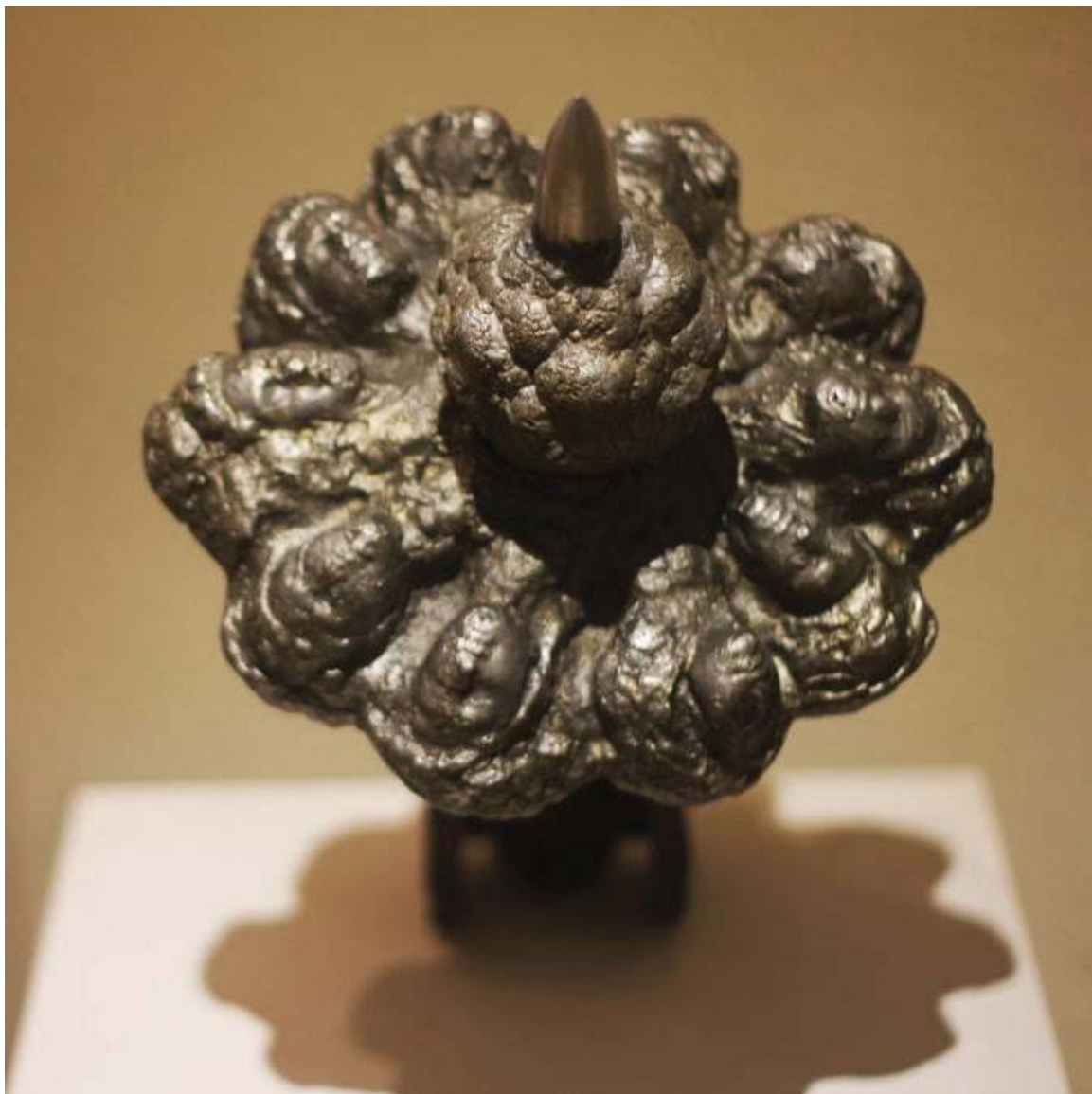
Title: 21 Gun Salute - 2 Medium: Aluminum, Cast Iron, Mild Steel Edition: 1/5 + 2AP Size: 18 x 18 x 46 Inches (with Plinth) Year: 2023