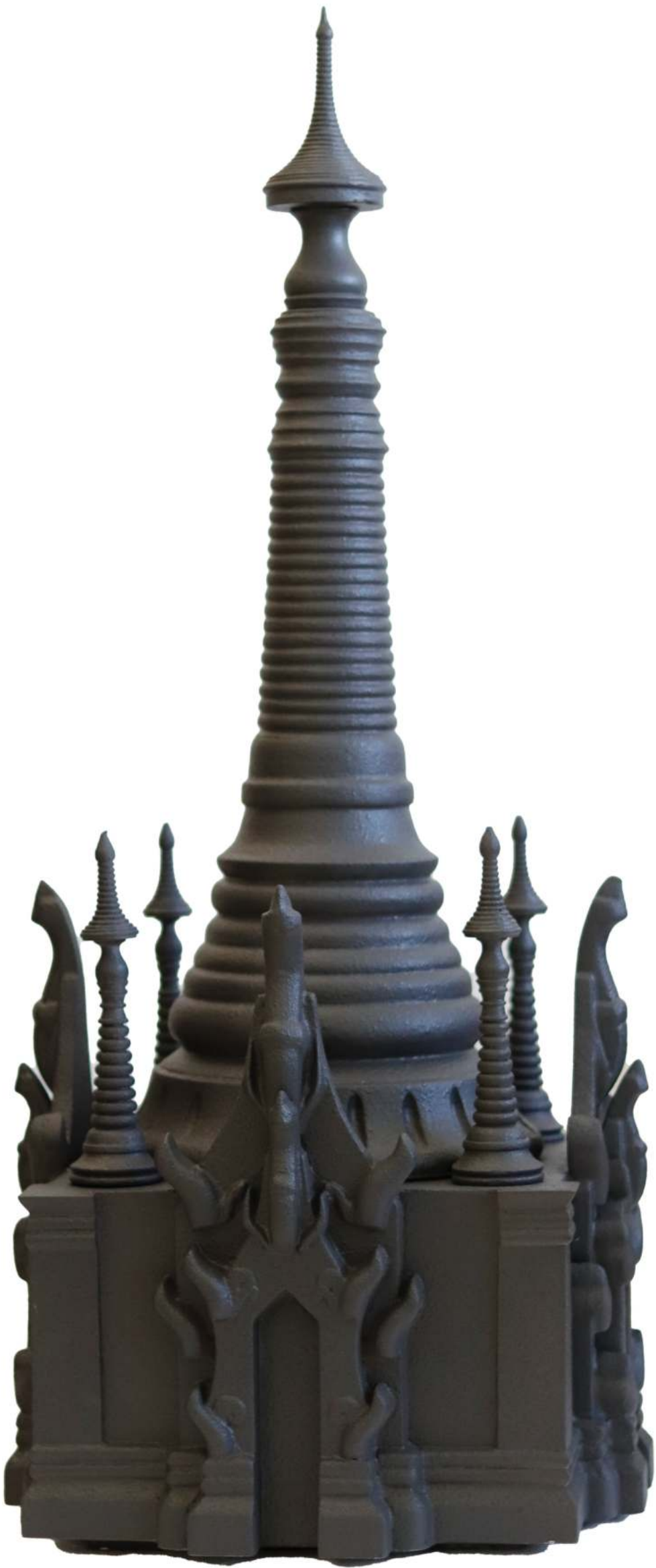
Title: The Belief Beyond IV Medium: Deco Paint on HDF, Ply and Wood Size: 31 x 13 x 13 (inches) Year: 2023