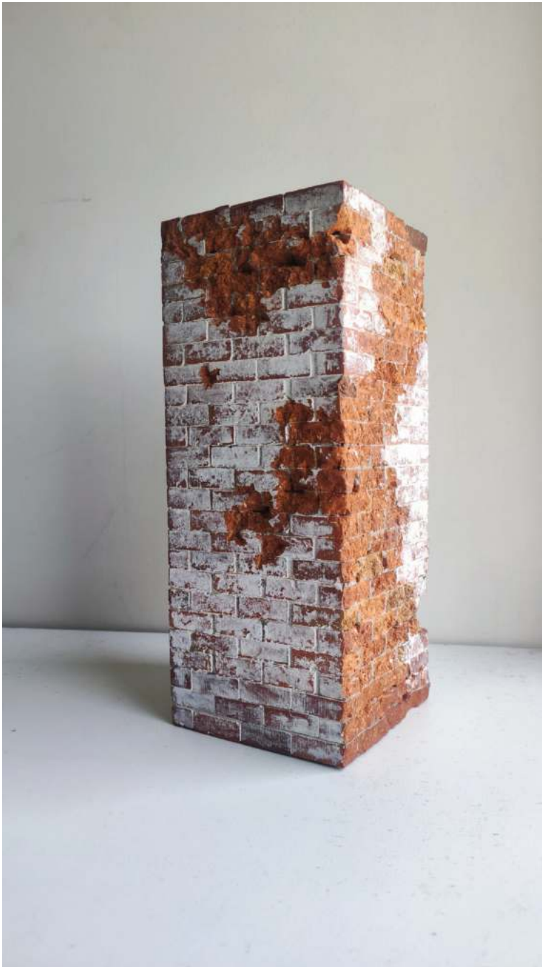
Title: Scars I can't Hide II Medium: Terracotta Bricks, Plaster, Cement and Paint Size: 10 x 4 x 4 Inches Year 2023