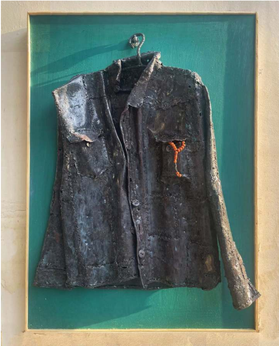
Title: Pocket Prayer Medium: Metal on Board Size: 48 x 36 Inches Year: 2023