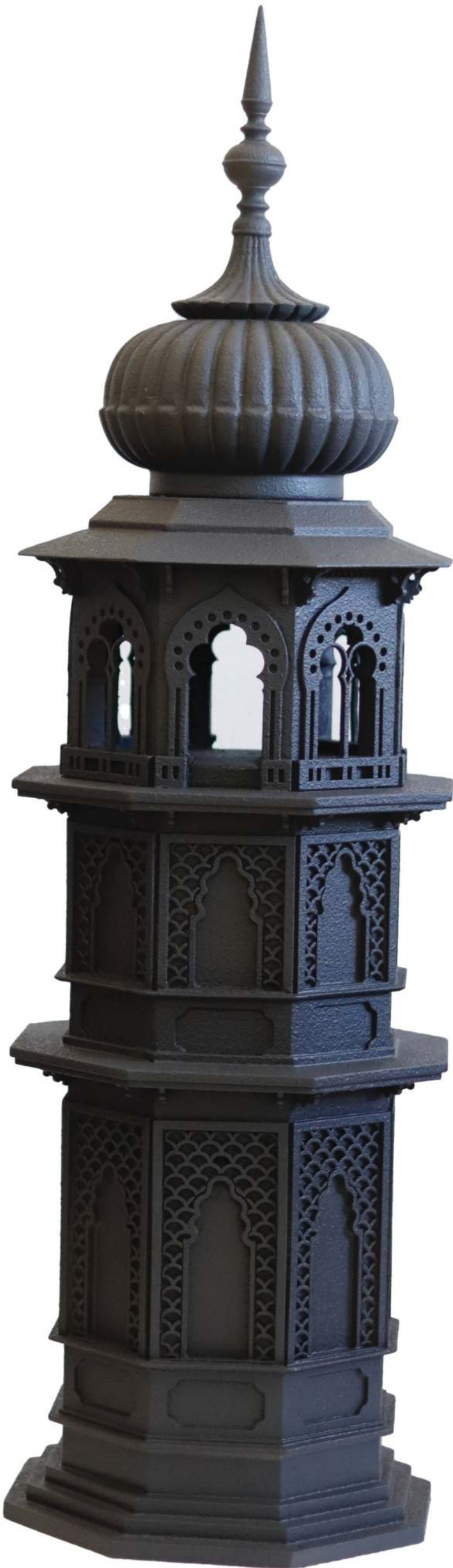
Title: The Belief Beyond II Medium: Deco Paint on HDF, Ply and Wood Size: 37 x 9 x 9 Inches Year: 2023